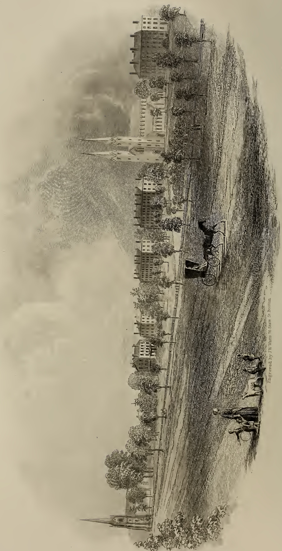
Engraved by J.W. Watts 76 State St. Boston