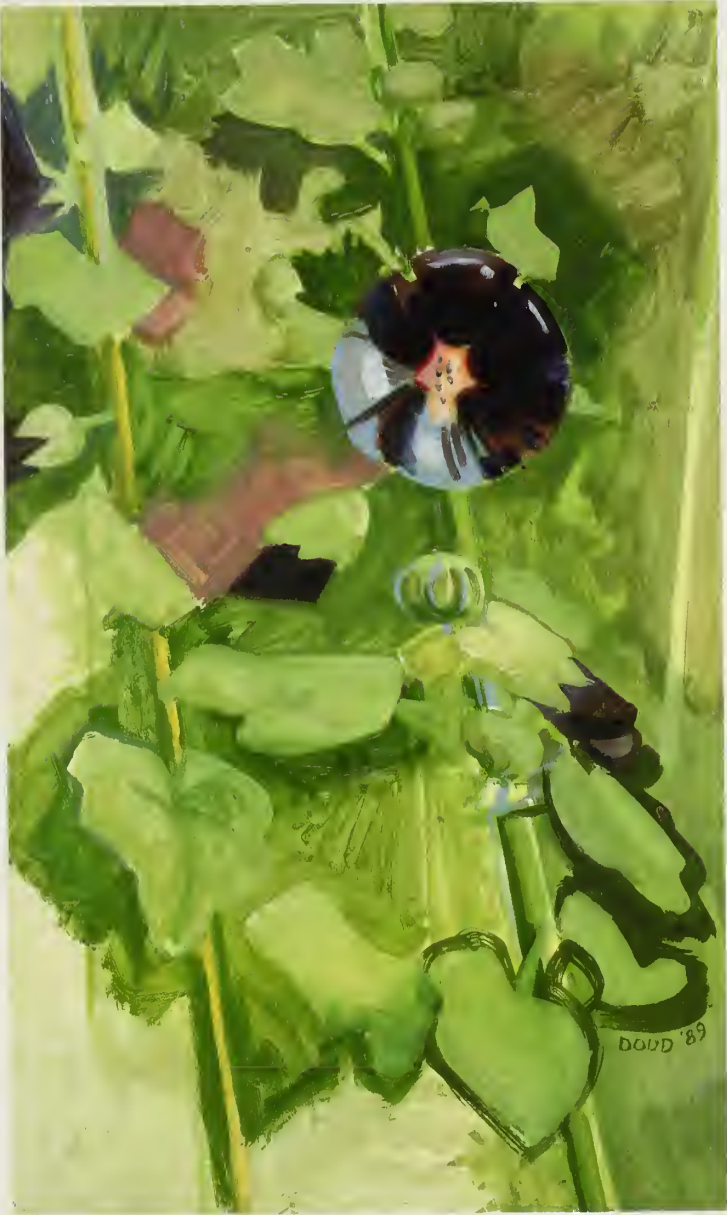
Black Hollyhock, 1989