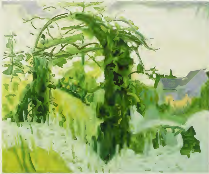
Arbor and White Plants, 1994

solid form in the painting and, in fact, seem to hold the whole composition in place. Nestled into the almost wild landscape, her secure home offers order and reprieve.