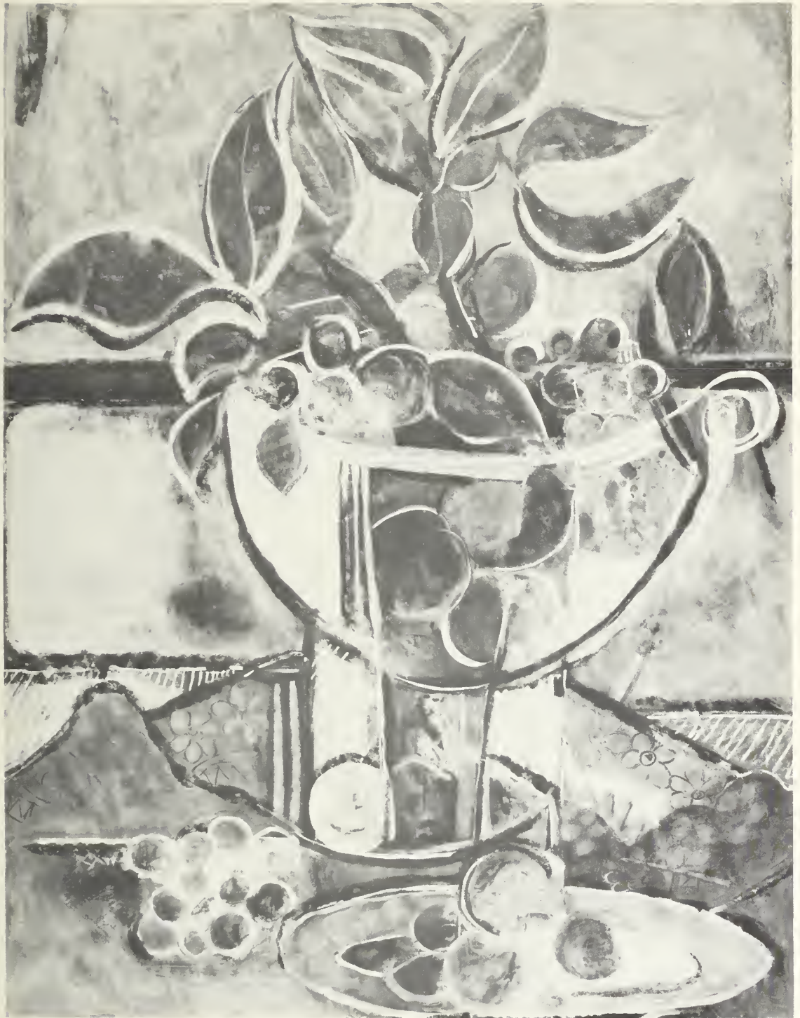
Still Life with Compote, 1973