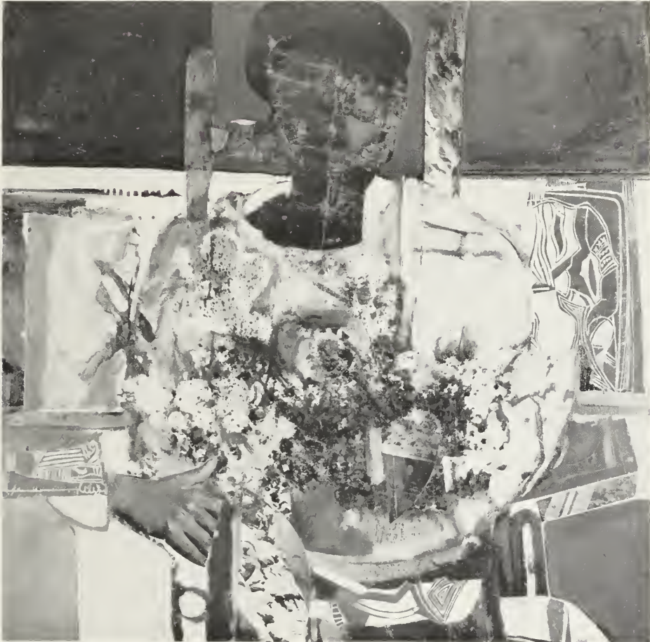
Woman with Flowers, 1972