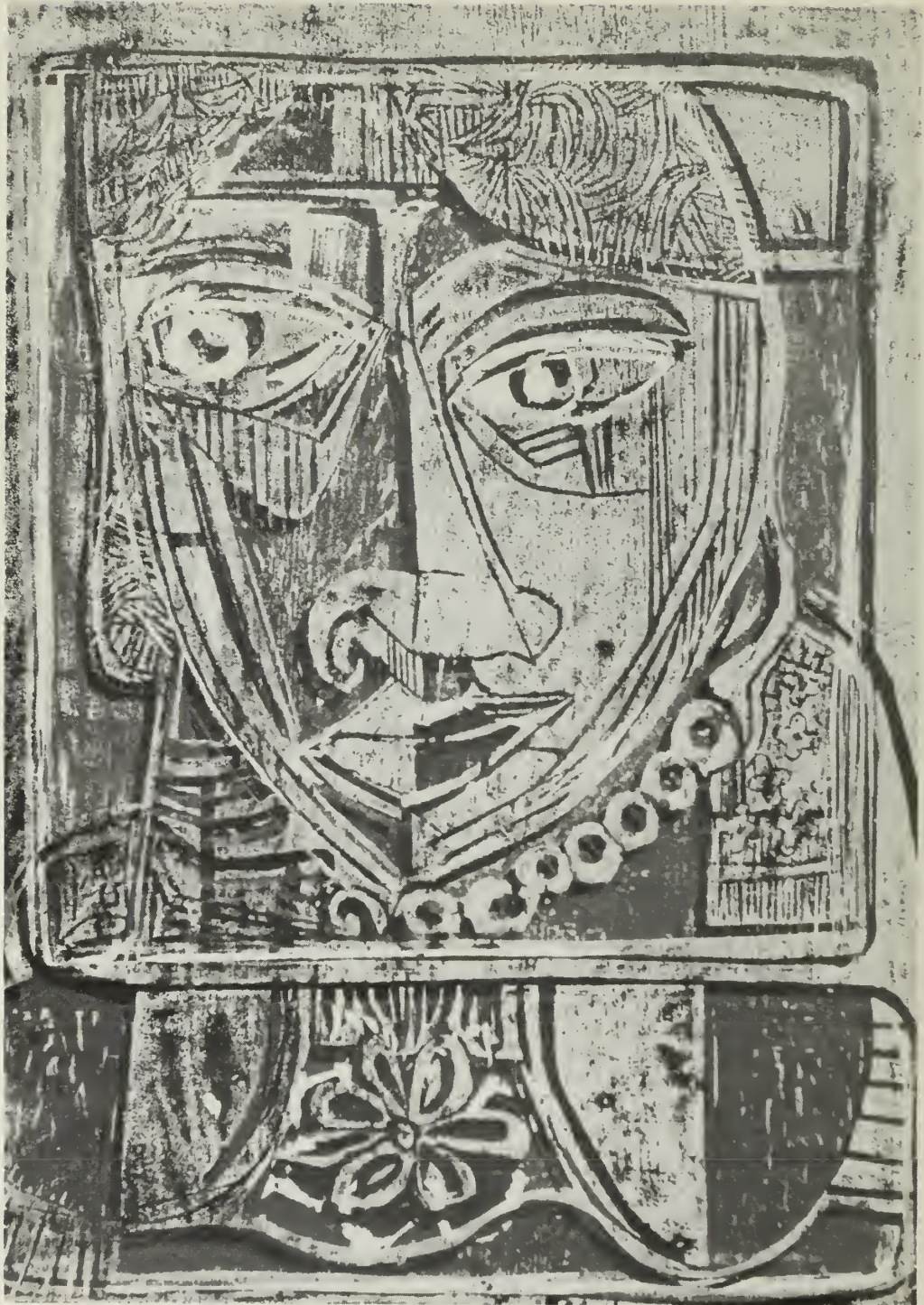
Benin Woman, III, 1972