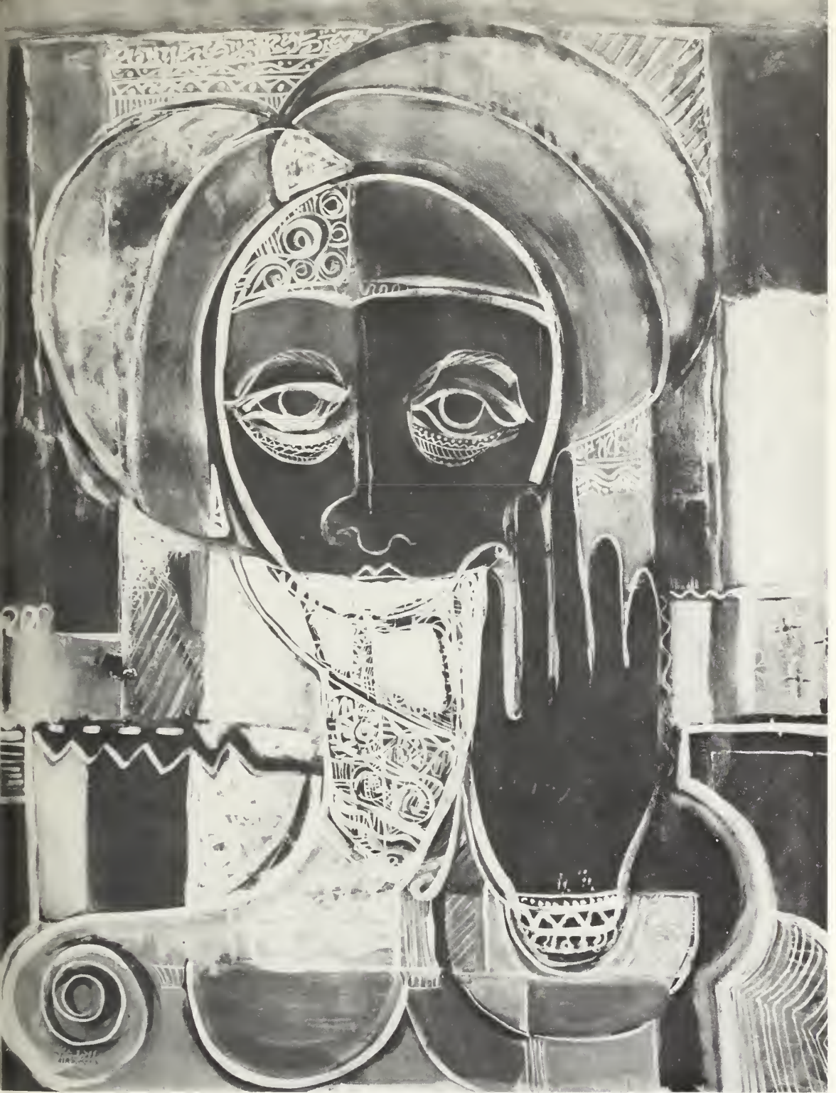
Ethiopian Bride, 1973