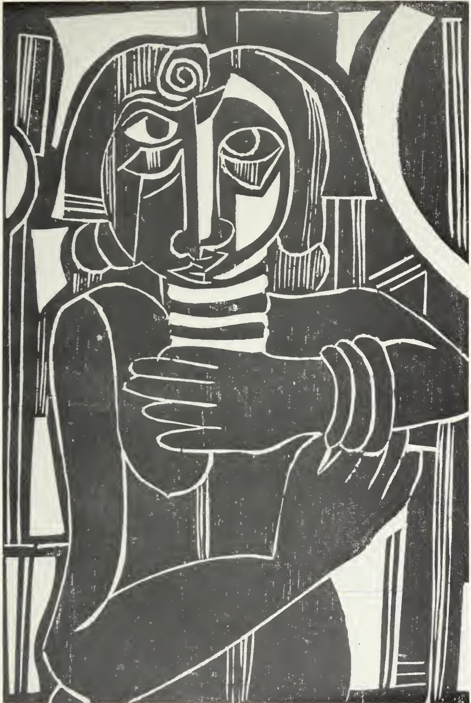
The Dancer, 1972