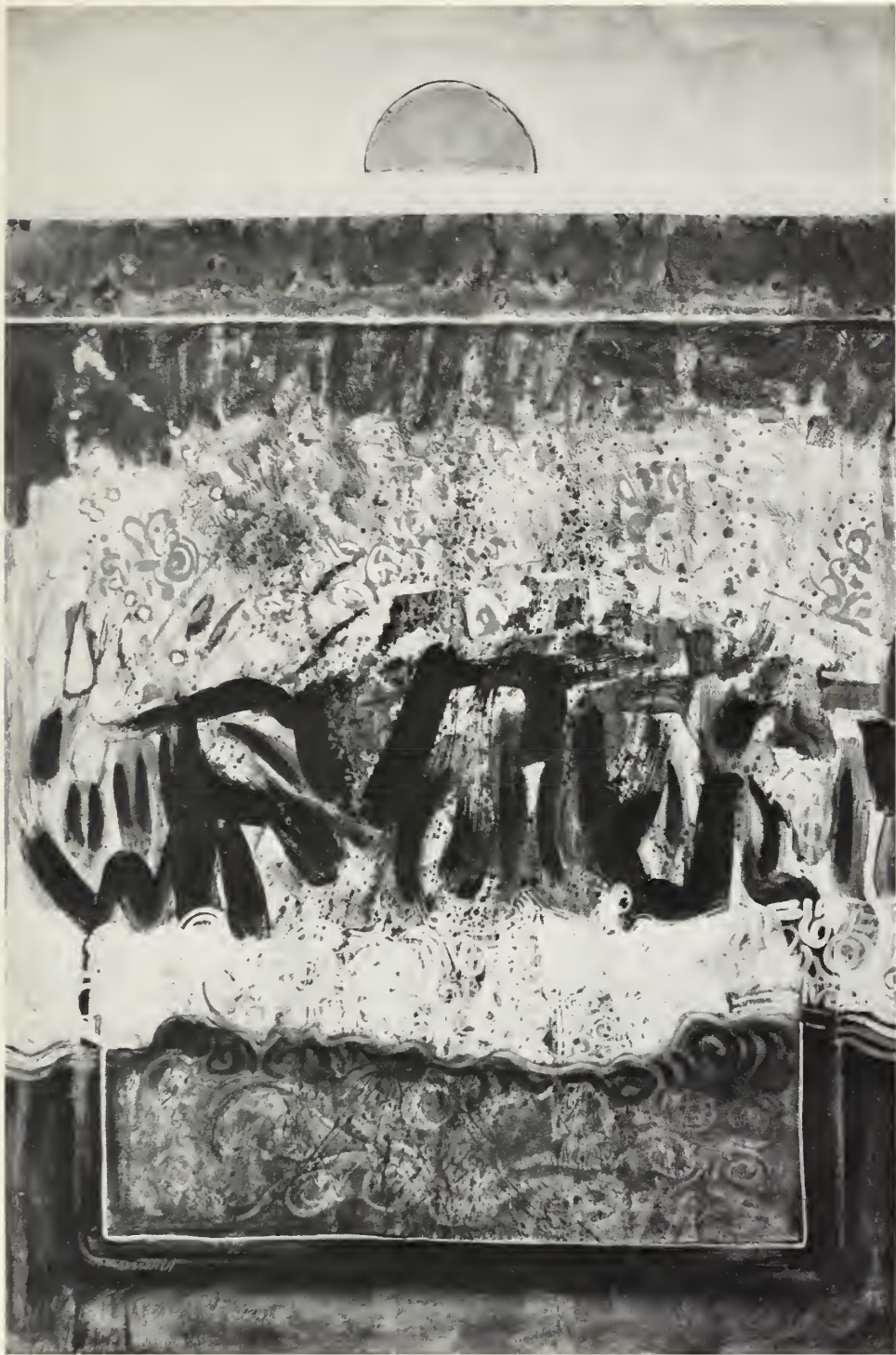
Land, Sea and Sky, 1973