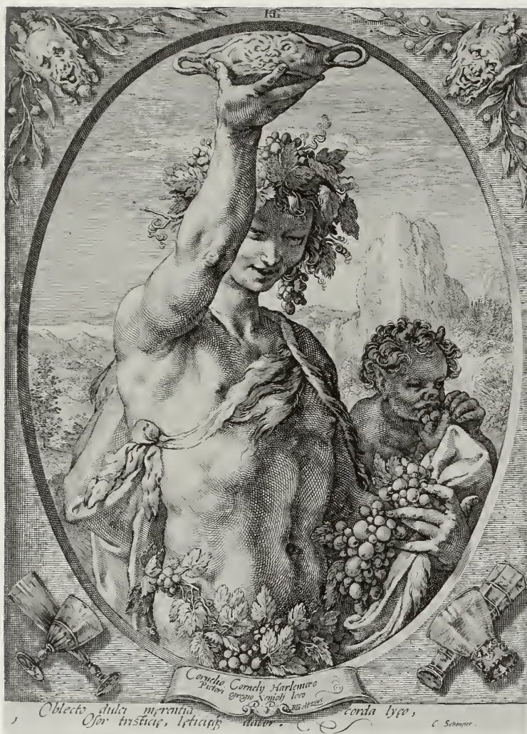
CATALOG NO. 37 Hendrik Goltzius, Bacchus

sive behavior, satyrs and maenads are antithetical to the civilized Greek man or woman. Some have posited that satyrs functioned as a means for cult members to explore an otherwise incomprehensible "otherness"—albeit from a comfortable distance—that characterizes Dionysos and his realm. In theory, worshipping Dionysos required his followers to relinquish socially accepted behavior and norms, or at least imagine doing so. To some extent satyrs and maenads functioned as safe projections of respectable Greek male and female selves turned upside down by the god. Experiencing alterity through the guise of the satyr or maenad was not an attempt to overthrow the normative social order, as one might expect, but rather a confrontation with the Dionysian, it was believed, ultimately reaffirmed that order. 17 Experiencing Dionysos was thus no mere excuse to act recklessly, but was seen by cult members as an important part of preserving civic codes.