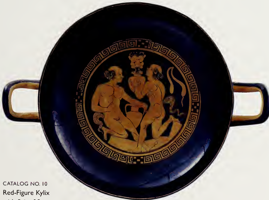
CATALOG NO. 10 Red-Figure Kylix with Pair of Satyrs

Certifying his importance in the antique world, Dionysos was the deity most often represented in ancient art. If images of his close associations—satyrs, nymphs, maenads, and Silenus—are counted as Dionysian, the god assumes even greater importance. 6 Bowdoin's rich collection of ancient art is no exception. This exhibition reaffirms the ubiquity of Dionysian themes in art, as seen in every imaginable medium, from vases, sculpture, and architectural fragments, to textiles, coins, jewelry,