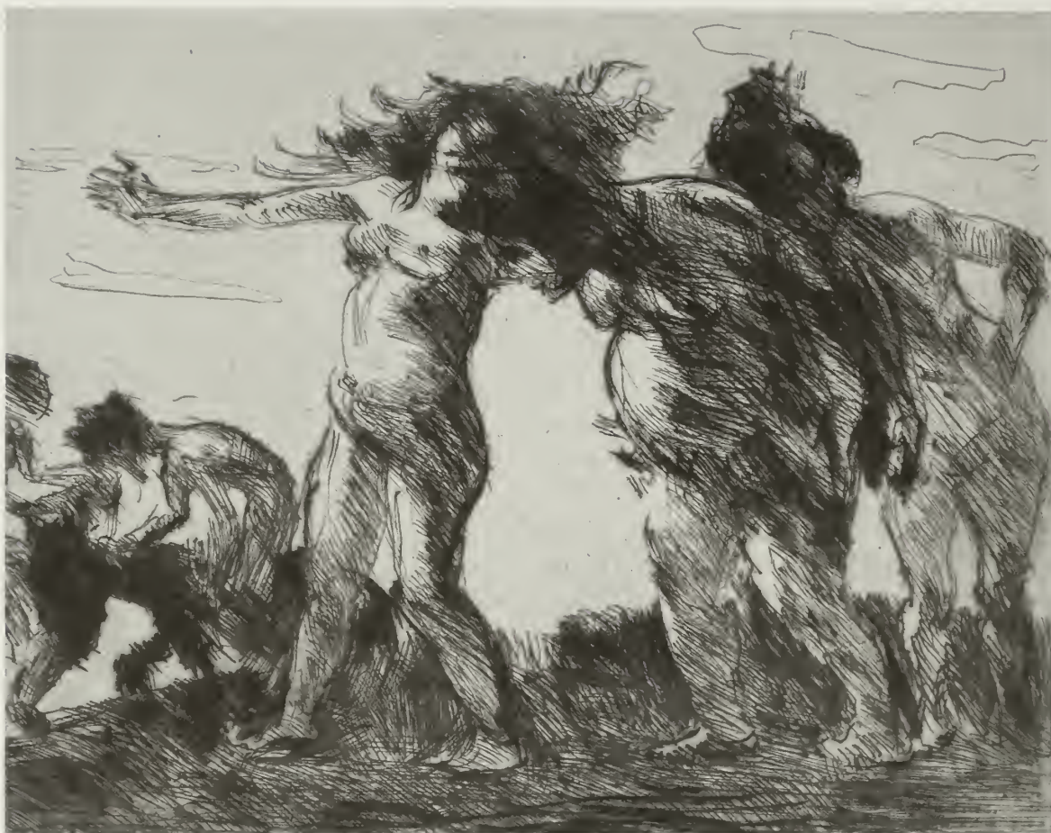
CATALOG NO. 58 Lovis Corinth, Bacchantenzug ( Bacchic Procession )