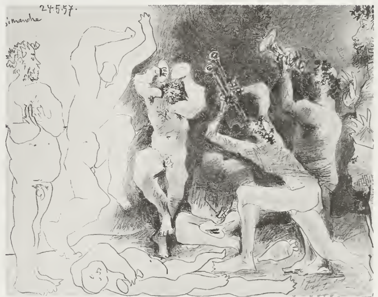
CATALOG NO. 60 Pablo Picasso, Fêtes des Faunes (Festival of the Fauns)

The work of Swiss artist Pipilotti Rist has also been described as an ongoing conversation about gender, but her concern is the construction of femininity. 33 Although Rist's types may not be as deliberately appropriated from ancient art as Barney's are, in her piece Ever Is Over All , the parallels between the lead female persona and an ancient Greek maenad are striking. Donning a blue party dress and glittering red pumps à la Dorothy in Oz , Rist's persona destroys a parked car with her oversized wand tipped with a giant blossom, which bears a likeness to the maenad's thyrsos . Although separated by approximately 2500 years, these two female personas do not merely look alike, they also project 'unruly' dispositions through acts