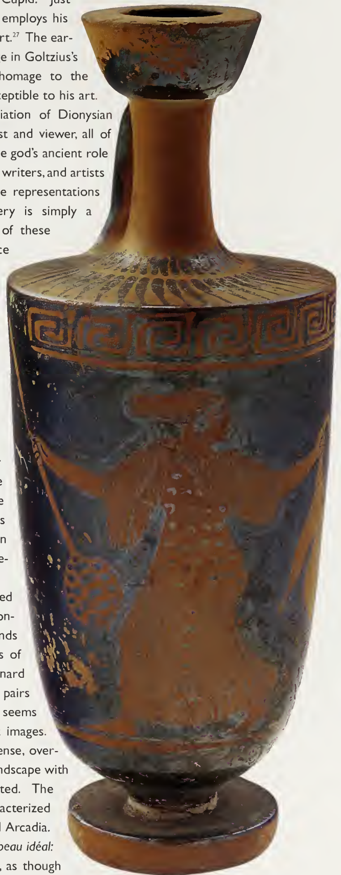
CATALOG NO. 5 Red-Figure Lekythos with Maenad in Flight

Jean-Honoré Fragonard's series of four etchings entitled Bacchanale (cat. 46), first printed in about 1763, demonstrates the idealized gloss which eighteenth-century minds imposed over the cultures of antiquity. Using sketches of antiquities made in Rome and in Herculaneum, Fragonard imagines a courtship between a satyr and a nymph: the pairs flirt, dance, kiss, and bear children together in a way that seems sentimental and even absurd in comparison to ancient images. The overt eroticism of the scene, together with the dense, overgrown garden scenery, recall nostalgically the untamed landscape with which Dionysos, god of fertility, was originally associated. The strained relations between satyrs and maenads that characterized Classical-period art are dissolved in this sweet pastoral Arcadia. Even the artist seems to know that this is nothing but a beau idéal : Fragonard keeps the satyr and nymphs frozen in stone, as though they were relics of a golden age that never existed.