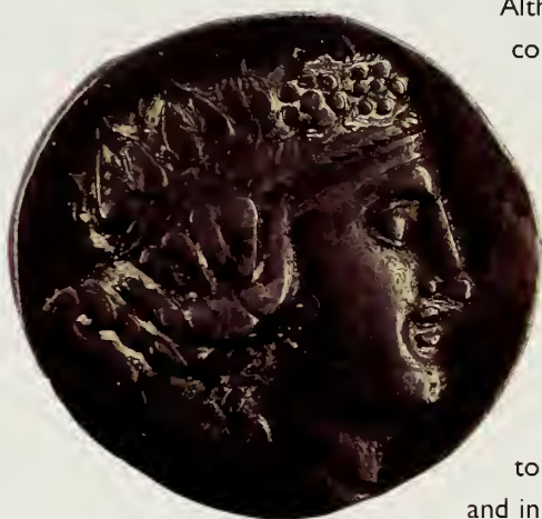
CATALOG NO. 36 Silver Tetradrachm of Thasos with Head of Dionysos