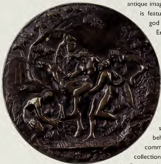
CATALOG NO. 52 Bronze Medal with Drunken Silenus

antique images of the god: with either a rotund or lithe physique, the god is featured with longish locks and a clean-shaven face. Often the god bears his wine cup or a bunch of ripe grapes, suggesting as Erasmus noted his connection to carefree merry-making. Images of satyrs parallel this more wanton Dionysos, with Silenus often depicted with an increased corpulence that suggests intemperance. Maenads and nymphs continue to appear, although in most cases their violent dispositions are considerably sweeter and more passive.