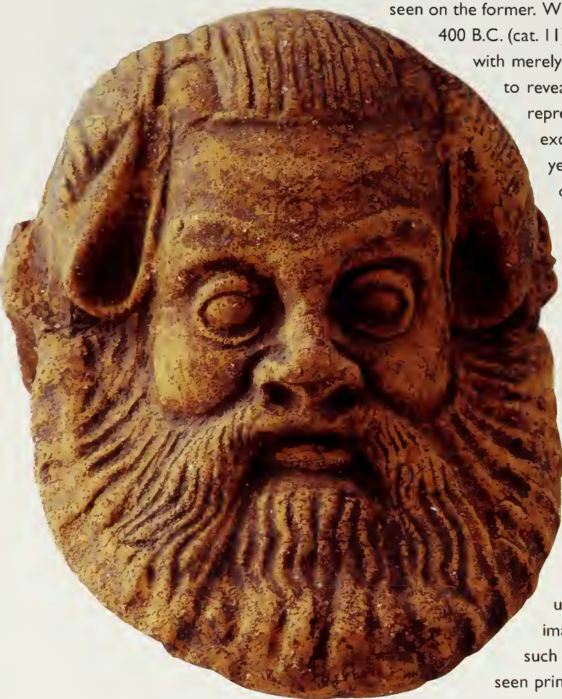
CATALOG NO. 14 Terra Cotta Mask of a Satyr

century B.C., however, the youthful image of the god had overwhelmingly supplanted the old god of the countryside. While one can still find images of the bearded god even in late antiquity, the sensuous, youthful Dionysos seen on the hydria (cat. 11) is largely representative of later Dionysian imagery. This figure is rendered somewhat womanly with longish locks and the elision of the genitals, but images of the god grow considerably more effeminate in later antiquity. Furthermore, these later tableaux rarely draw upon recognizable myths, and this thwarts even basic identifications of the individual pictorial elements. The hydria represented here is an ideal example: precisely what this group of figures is intended to represent remains an open-ended question since no definitive identifications of the figures can be made. 12