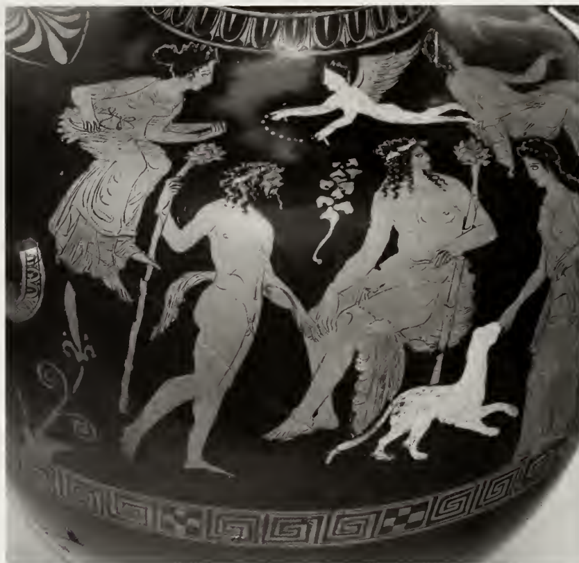
CATALOG NO. 11 Red-Figure Hydria with Dionysos and Entourage of Satyr, Maenads, Hermes, Erotes, and Panther (detail)

Although archaeological evidence suggests that the origins of the Dionysian cult date to the Bronze Age, the earliest figurative representations of the deity date to the sixth century B.C. Bowdoin's black-figure panel amphora (cat. 2) is a fine example of this nascent type. Dionysos appears here clothed in a chiton surrounded by a small gathering of nymphs and satyrs. In his left hand, the god holds a vine heavy with ripe grapes, and with his right, he holds up a rhyton, a ceremonial drinking cup commonly used in antiquity. Dionysos is depicted with important indications of his divine identity: in addition to the vine and the cup that he bears, he is bedecked with a crown of ivy. Together with the grape vine, ivy was long associated with the god for