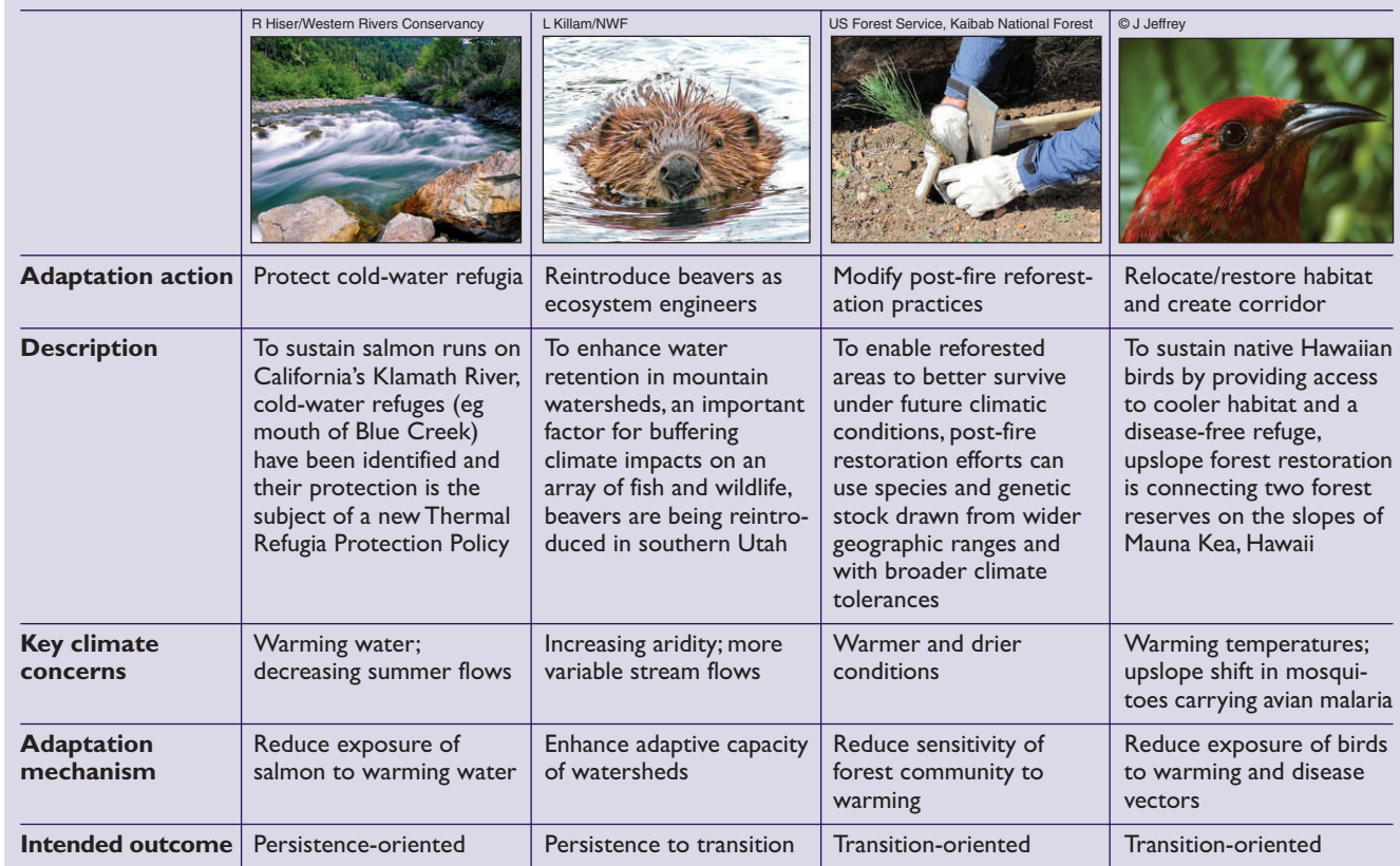
Table 1. Illustrative adaptation efforts

characterized as containing a number of similar steps; Figure 2 represents a generalized adaptation planning and implementation cycle that reflects several of these commonalities. This planning and implementation framework draws from, and mirrors, many standard conservation planning processes but is designed specifically to incorporate climate considerations, particularly through its emphasis on assessing climate-related vulnerabilities (step 2) and on reconsidering goals and objectives in light of those impacts and vulnerabilities (step 3). Although this cycle explicitly addresses climate considerations, the critical phase of evaluating and selecting adaptation options (step 5) necessarily considers not just technical