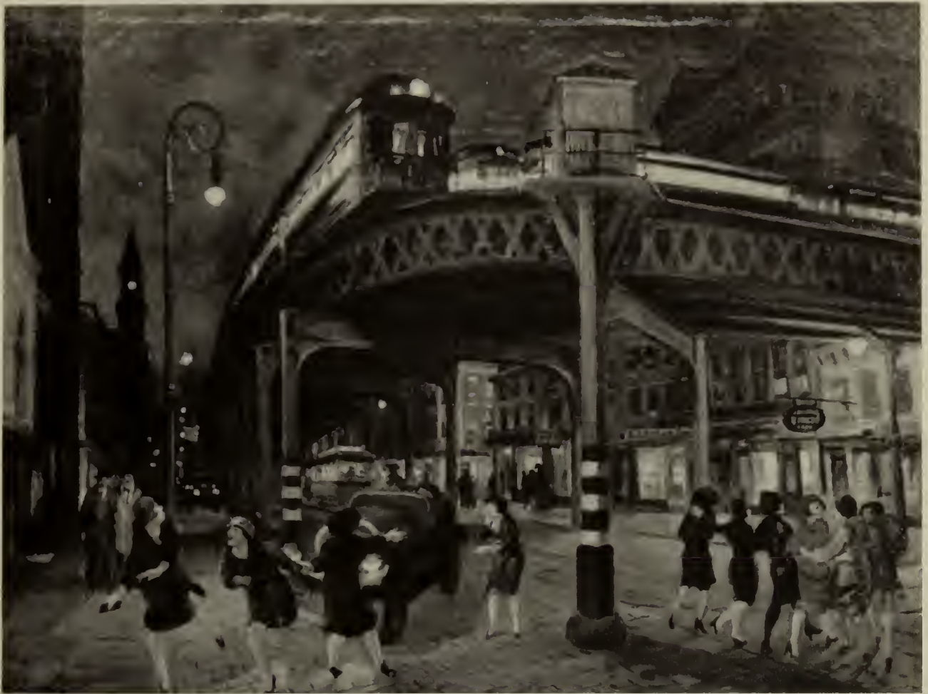
SIXTH AVENUE ELEVATED AT THIRD STREET. 1928. 30 x 40. Whitney Museum of American Art.