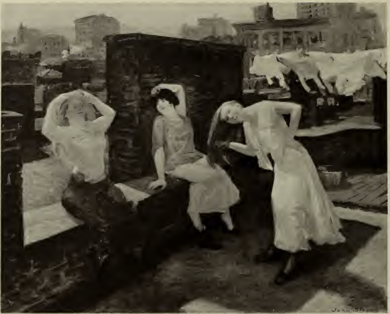
SUNDAY, WOMEN DRYING THEIR HAIR. 1912. 25½ x 32½. Addison Gallery of American Art.