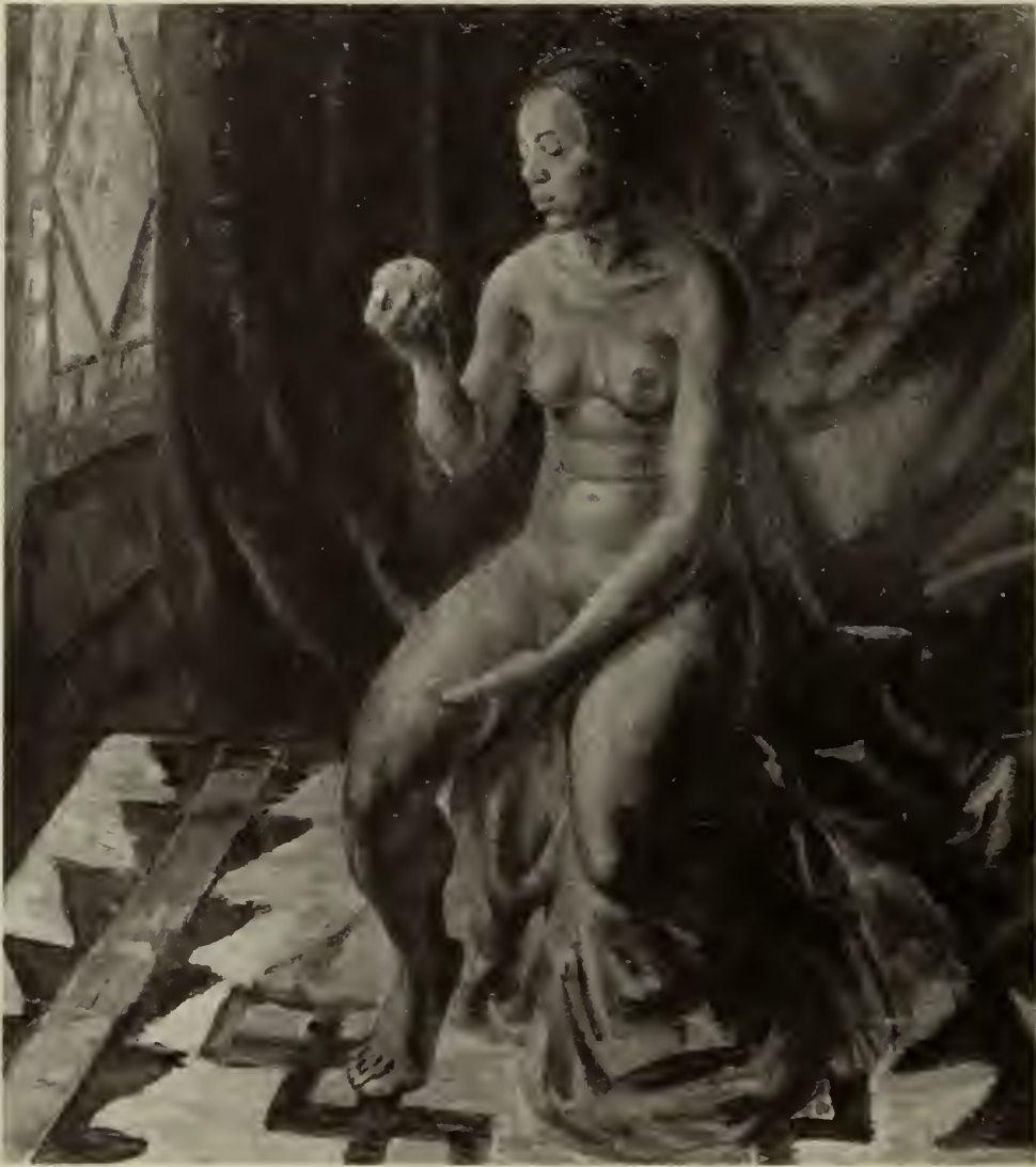
NEGRESS WITH GREEN APPLE. 1927. 25 x 23. Kraushaar Galleries.