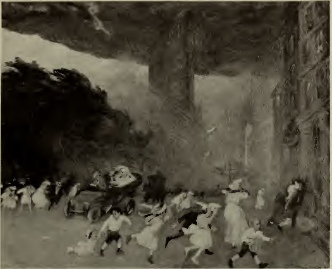
DUST STORM, FIFTH AVENUE. 1906. 22 x 27. Metropolitan Museum of Art, George A. Hearn Fund.