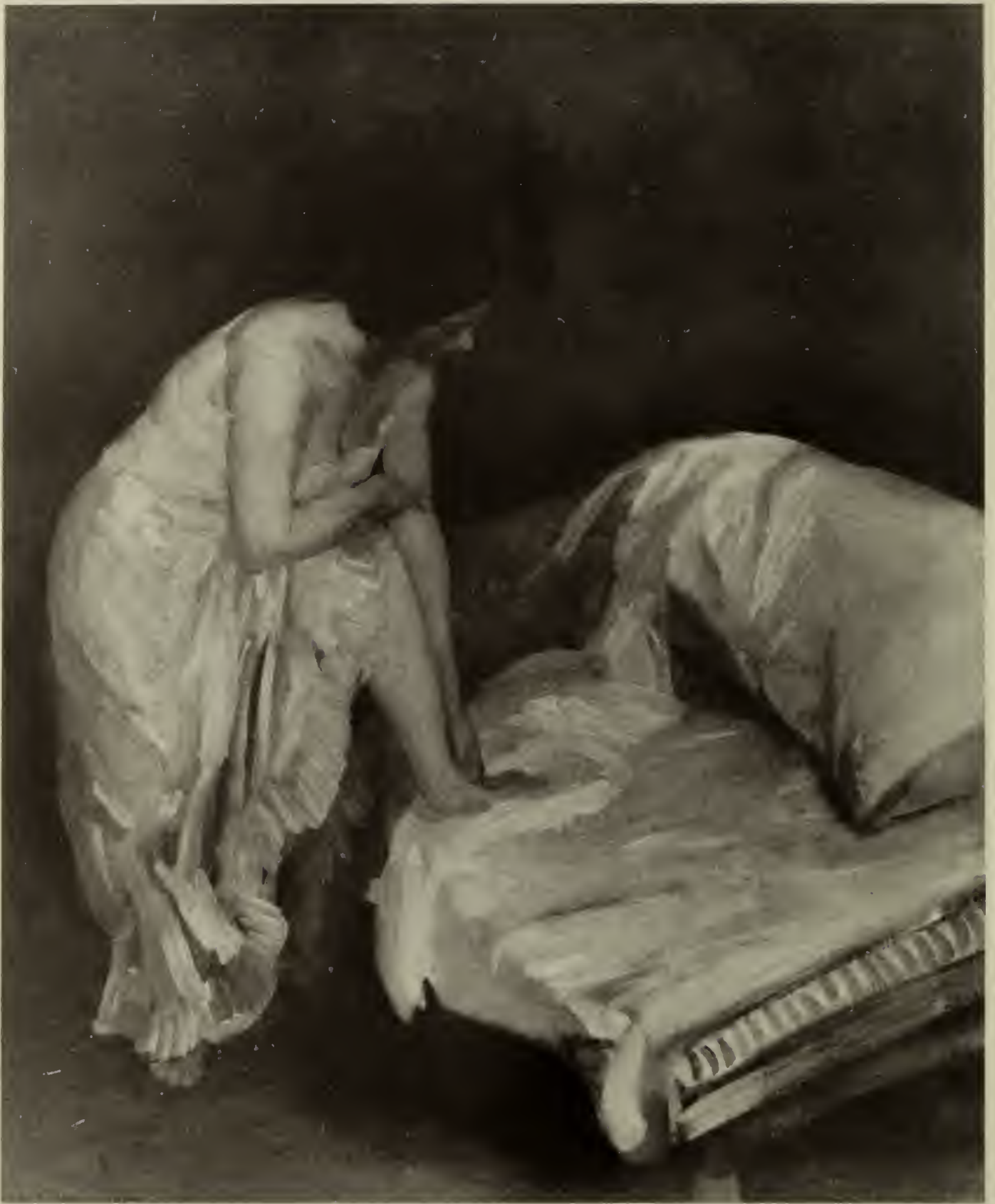
THE COT. 1907. 36¼ x 30. Hamlin Collection, Bowdoin College.