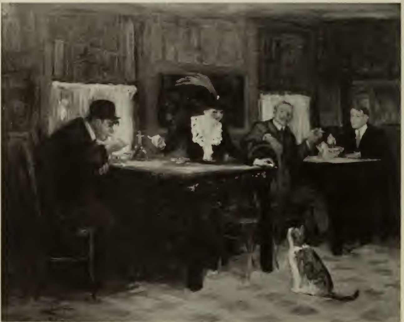
CHINESE RESTAURANT. 1909. 26 x 32. Memorial Art Gallery, University of Rochester, R. T. Miller Fund.