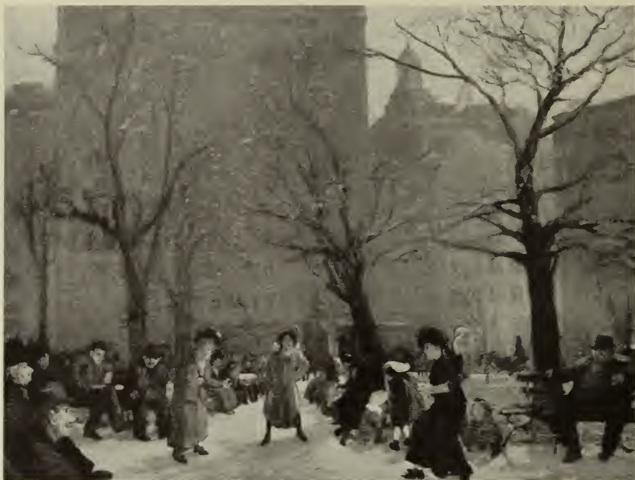
NURSEMAIDS, MADISON SQUARE. 1907. 24 x 32. University of Nebraska Art Gallery, Frank M. Hall Collection.