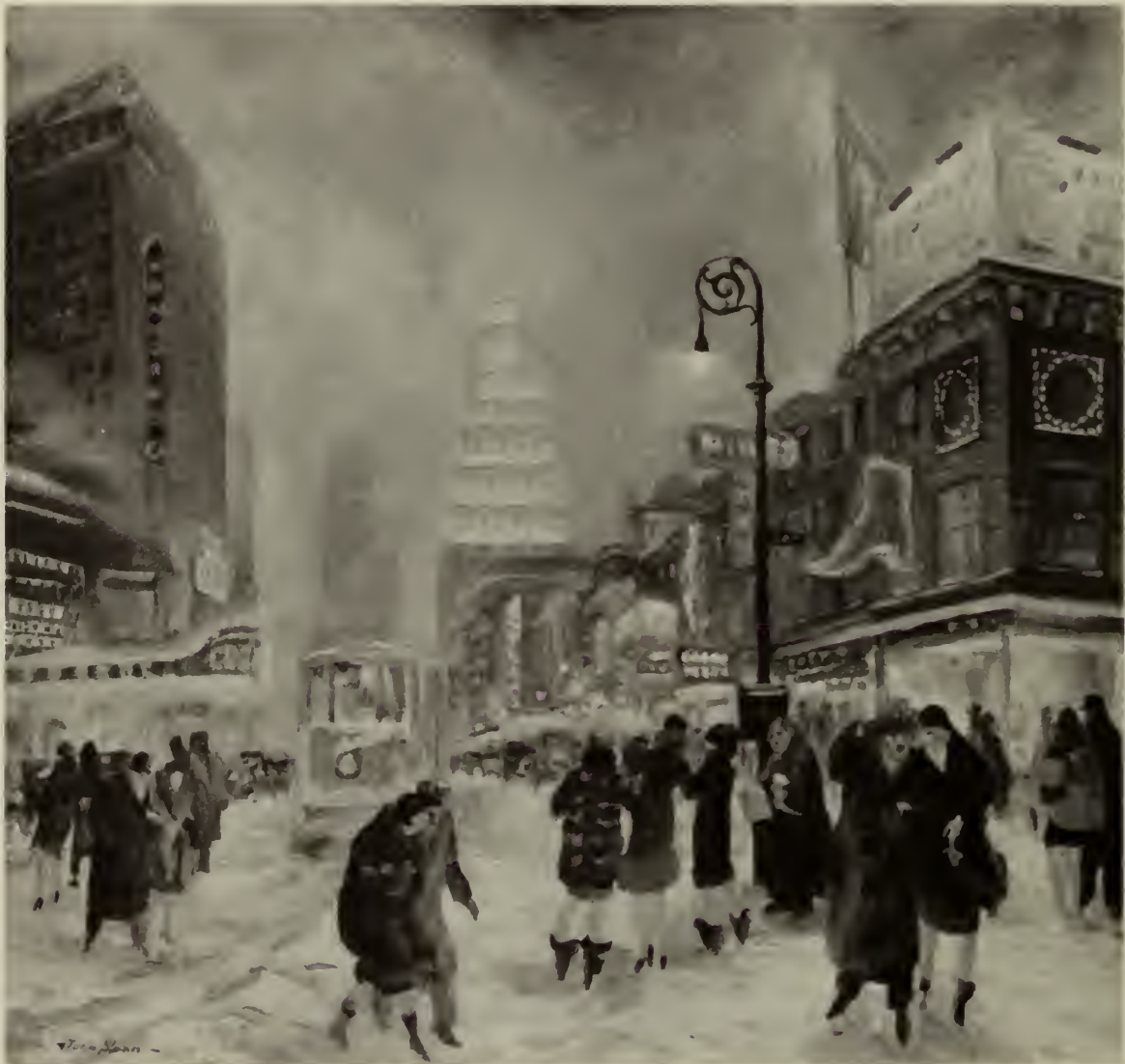
THE WHITE WAY. 1926. 30 x 32. Philadelphia Museum of Art.