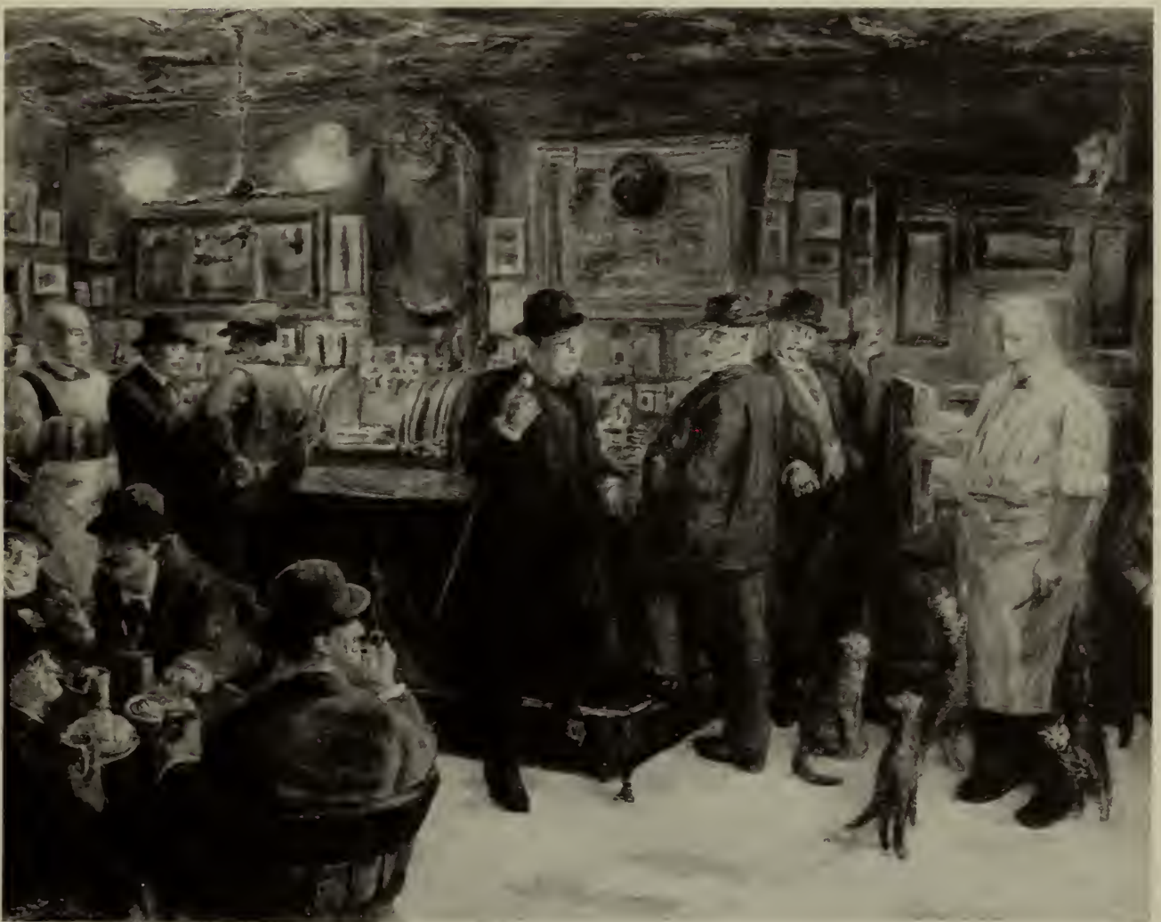
McSORLEY'S CATS. 1929. 35½ x 45½. Estate of John Sloan.