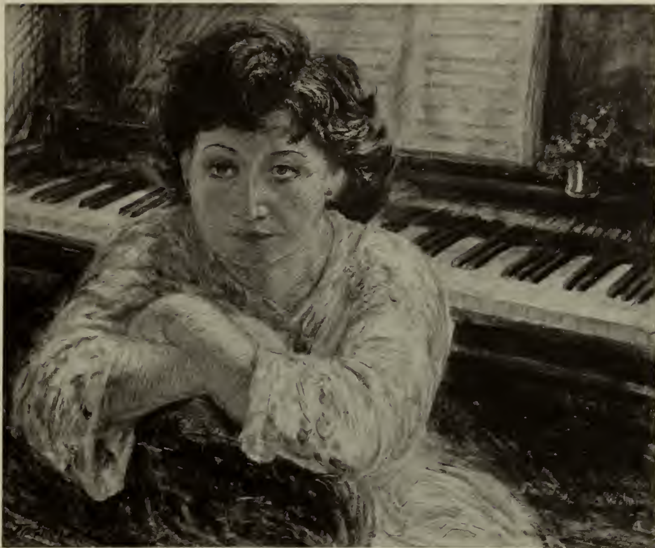
GIRL, BACK TO PIANO. 1932. 20 x 24. Kraushaar Galleries.