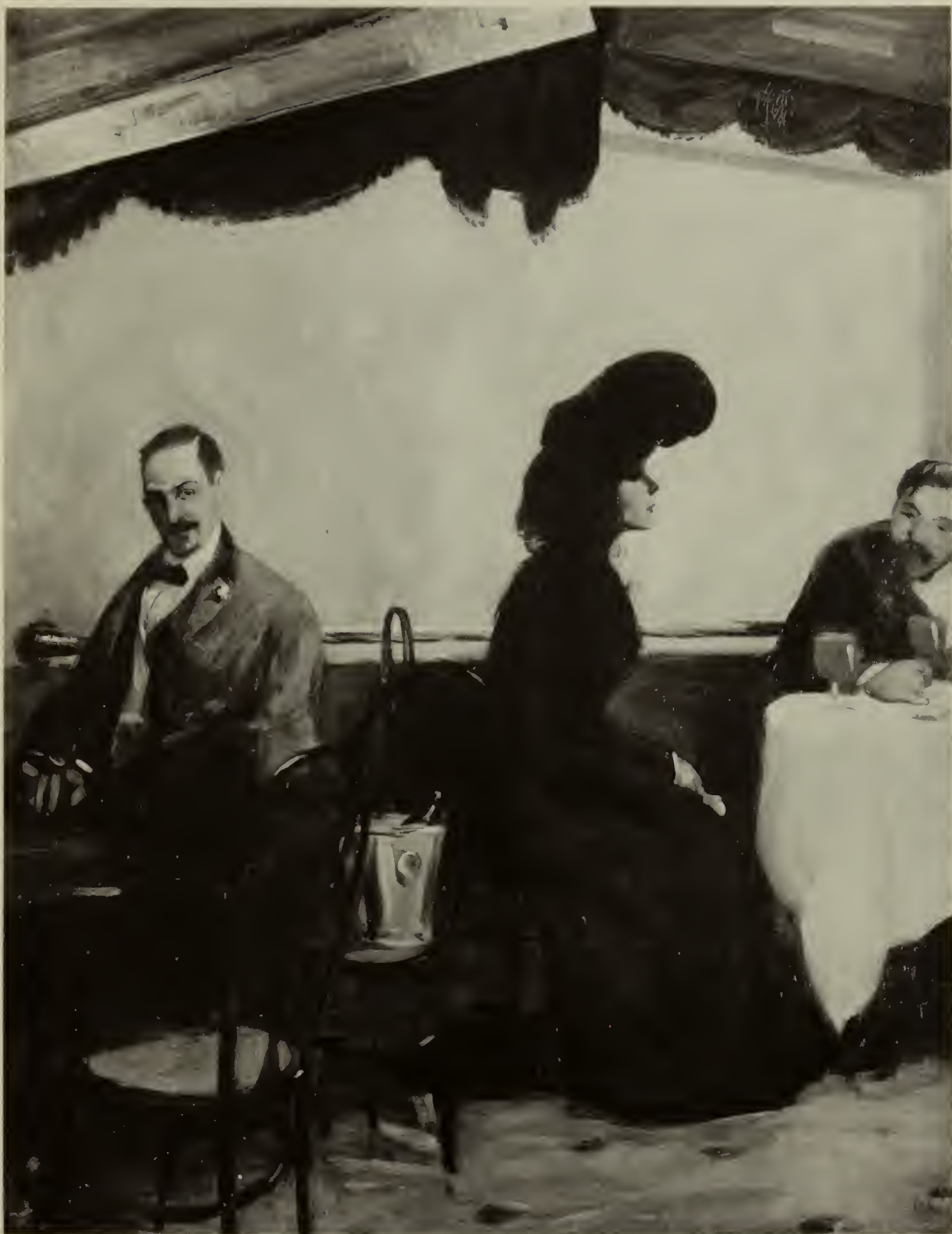
THE RATHSKELLER. 1901. 35½ x 27½. Cleveland Museum of Art, gift of the Hanna Fund.