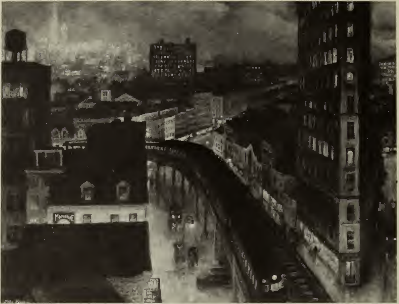
THE CITY FROM GREENWICH VILLAGE. 1922. 26 x 34 \frac{1}{8} . Estate of John Sloan.