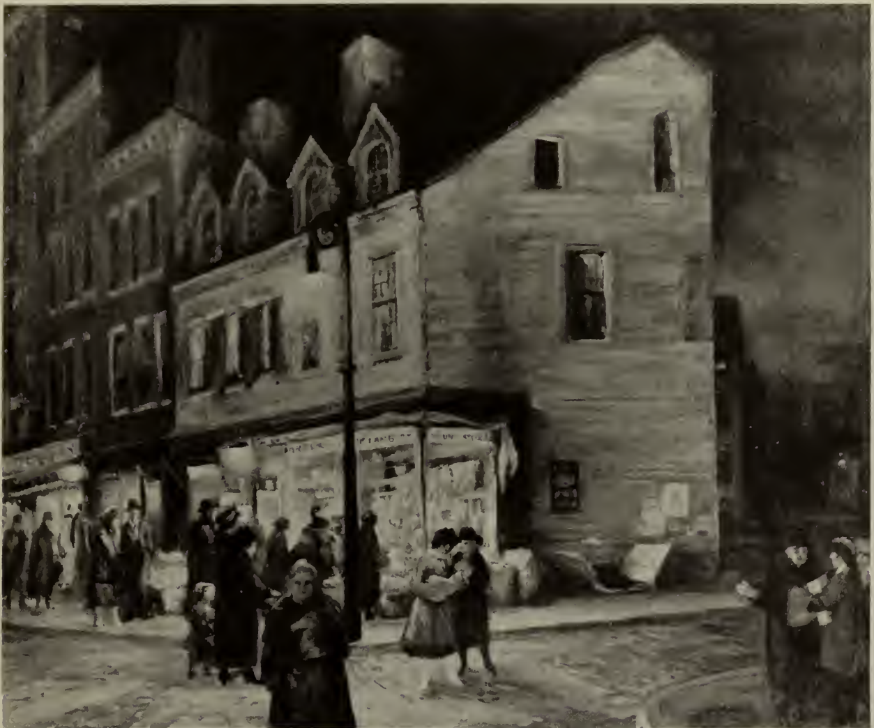
BLEECKER STREET, SATURDAY NIGHT. 1918. 26 x 32. Collections of the International Business Machines Corporation.