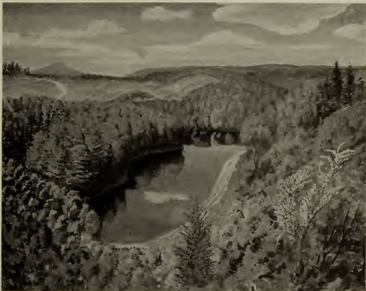
MINK BROOK (Hanover, New Hampshire). 1951. 24 x 30. Estate of John Sloan.