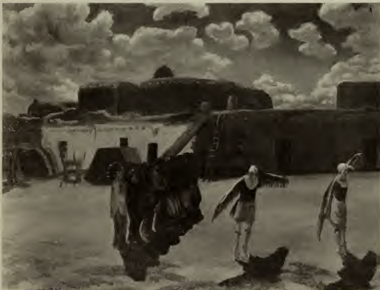
EAGLES OF TESUQUE. 1921. 26 x 34. Kraushaar Galleries.