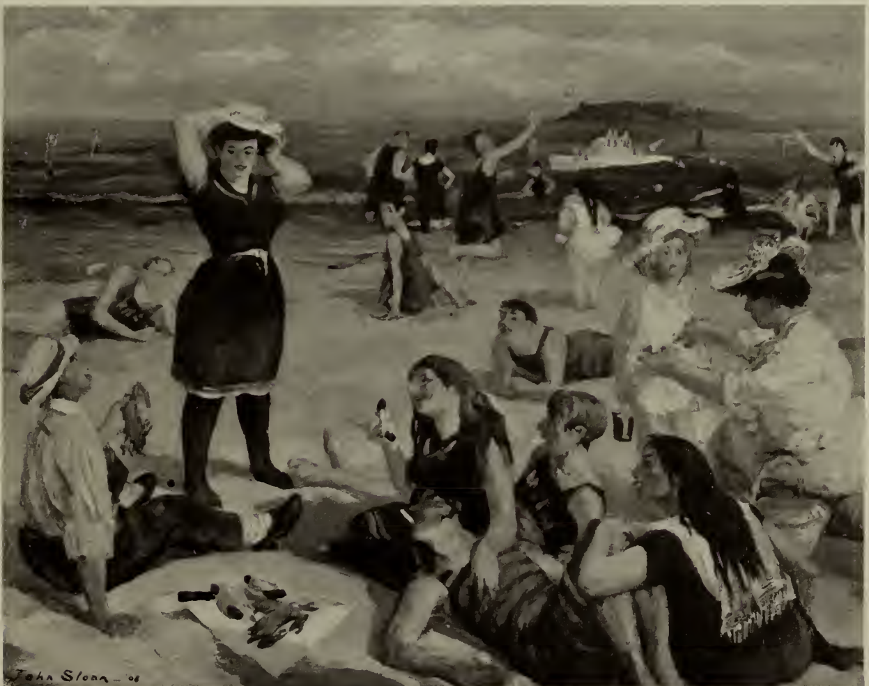
SOUTH BEACH BATHERS. 1908. 25 \frac{7}{8} x 31 \frac{7}{8} Walker Art Center.