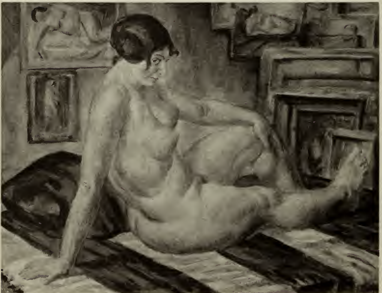
NUDE AND PICTURE FRAMES. 1928. 20 x 26. Kraushaar Galleries.