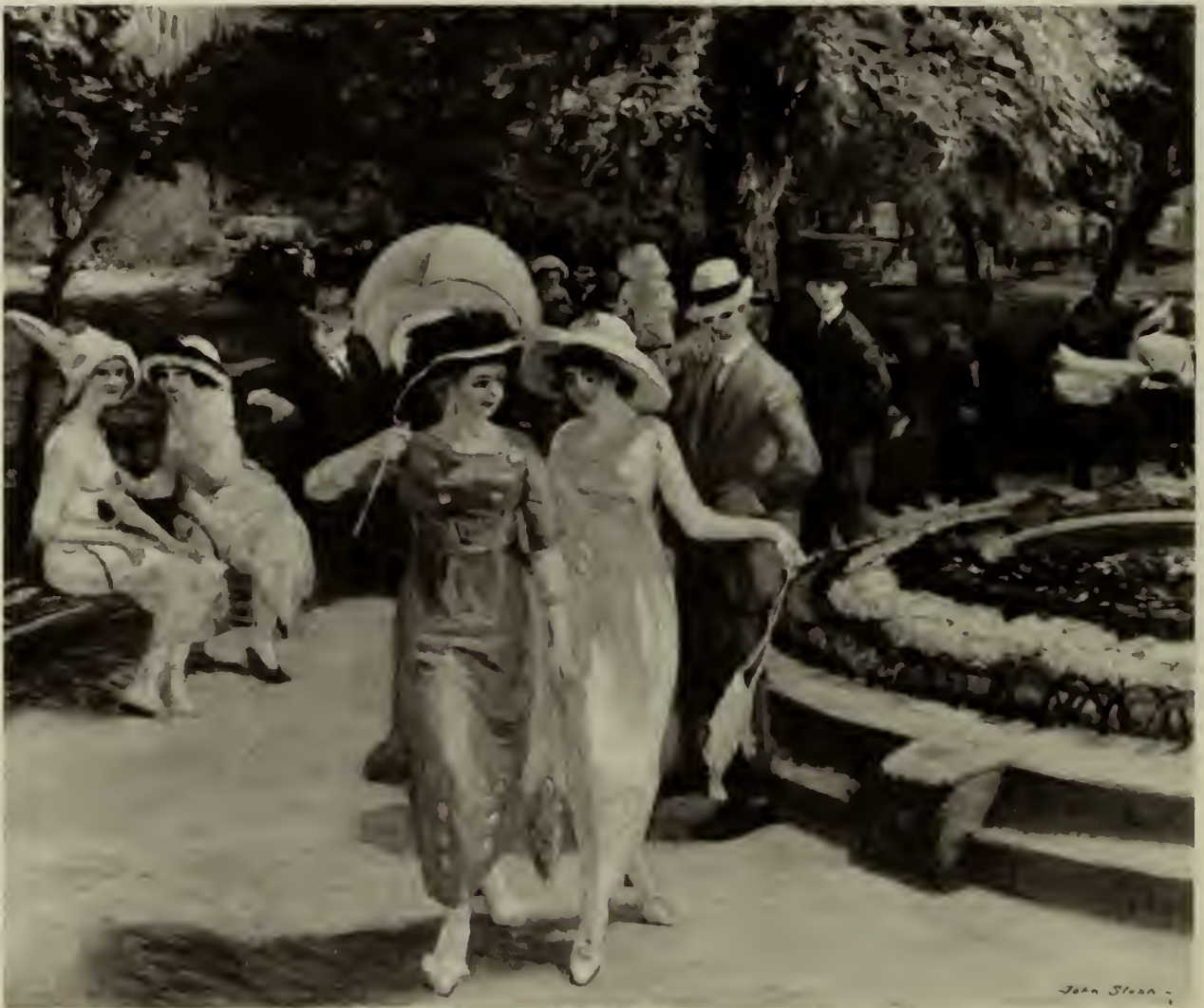
SUNDAY IN UNION SQUARE. 1912. 26¼ x 32¾. Hamlin Collection, Bowdoin College.