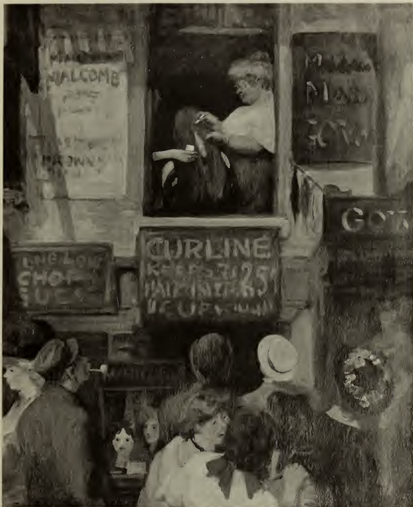
HAIRDRESSER'S WINDOW. 1907. 32 x 26. Wadsworth Atheneum.