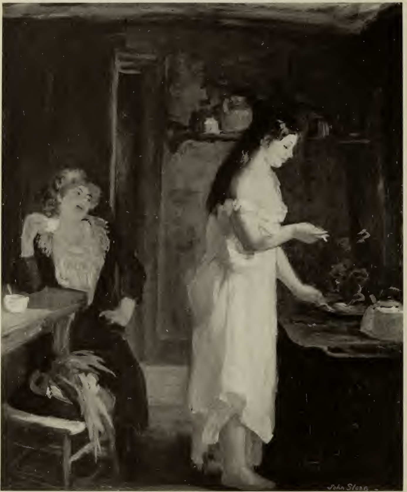
THREE A.M. 1909. 32 x 26. Philadelphia Museum of Art.