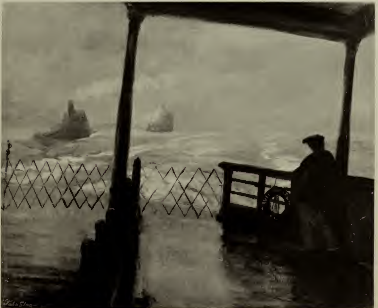
THE WAKE OF THE FERRY. 1907. 26 x 32. Phillips Gallery.