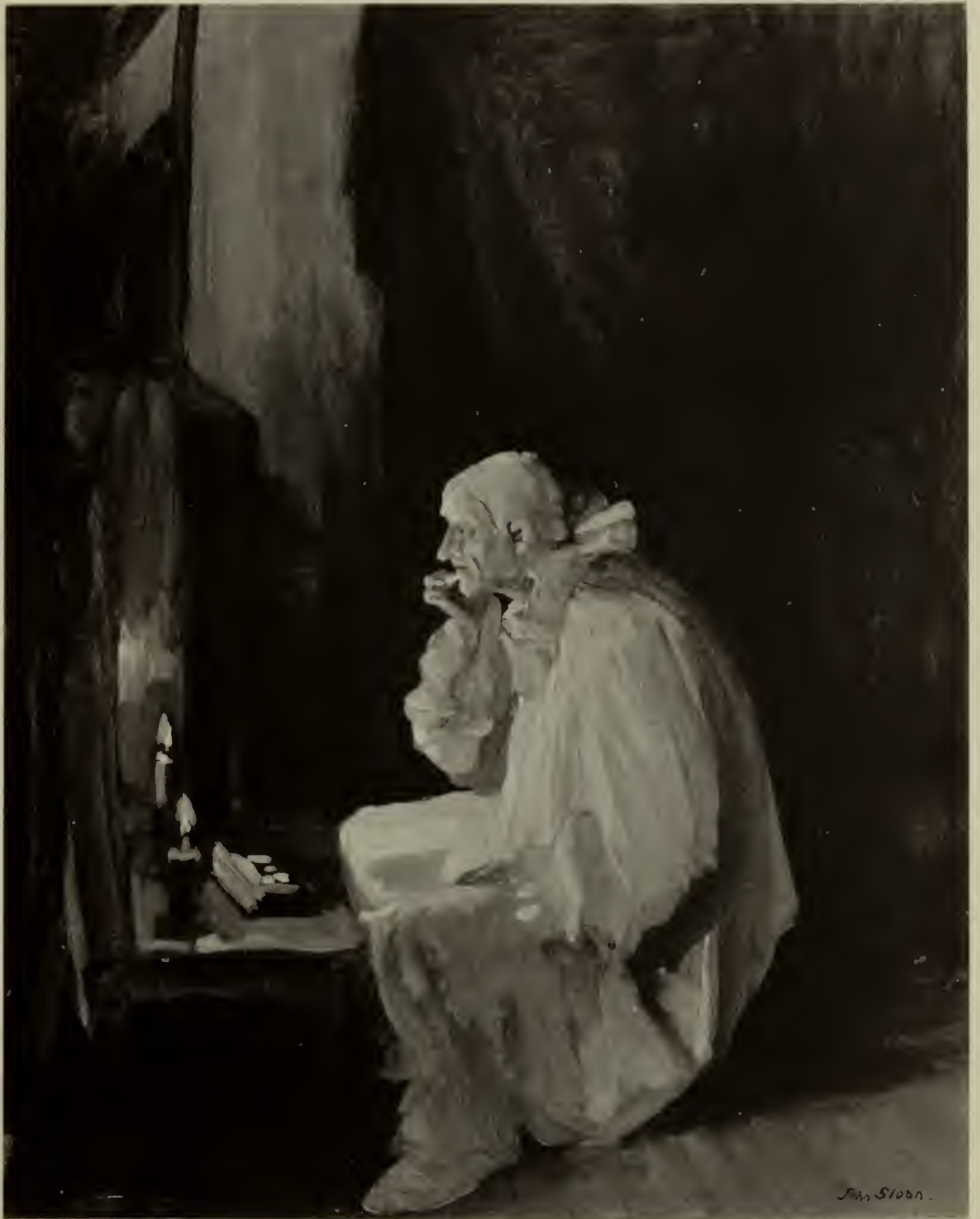
OLD CLOWN MAKING UP. 1909. 32 x 26. Phillips Gallery.