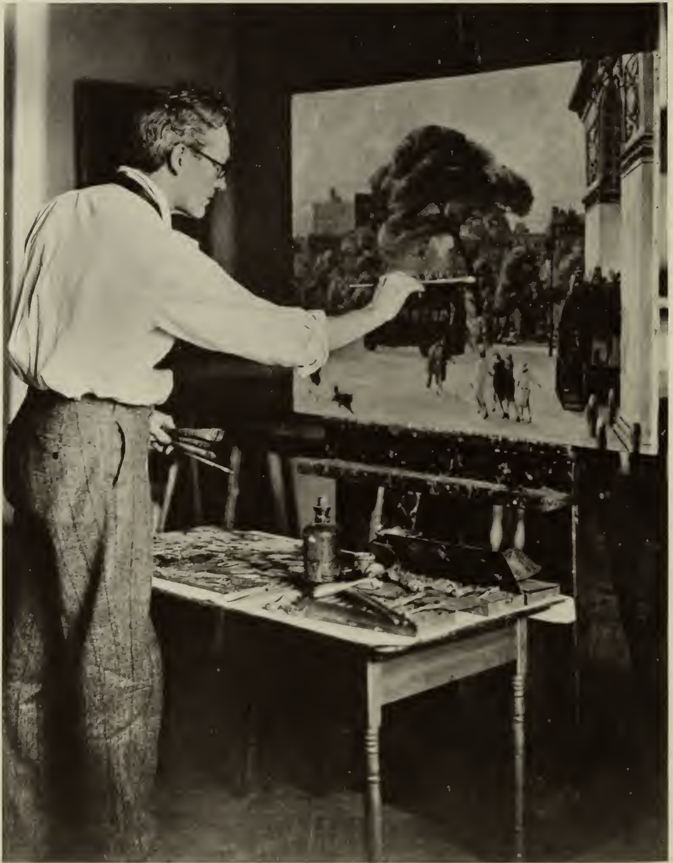
John Sloan painting BUSES IN THE SQUARE in 1927, at the age of fifty-six.