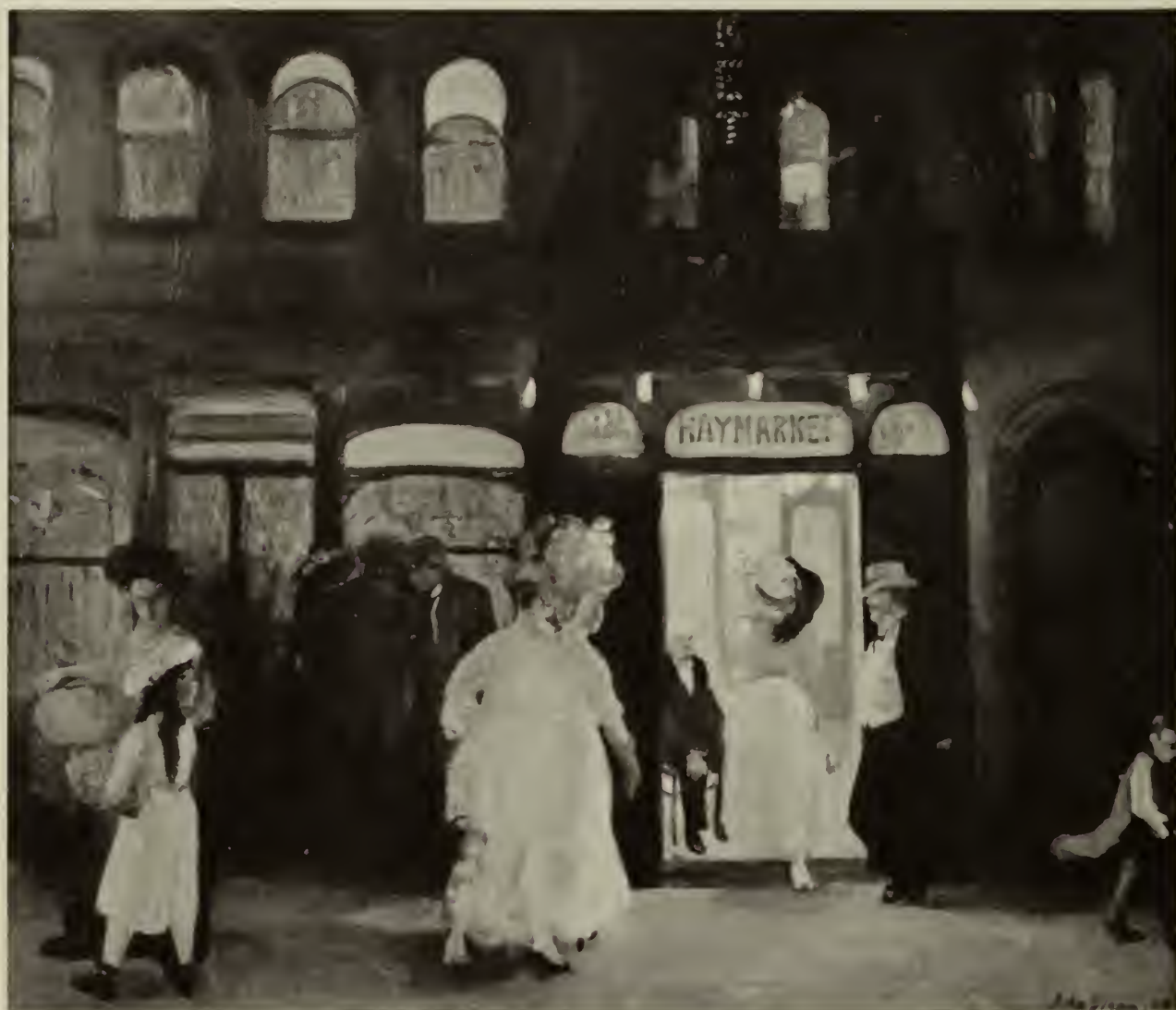
THE HAYMARKET. 1907. 26 x 31 \frac{7}{8} . The Brooklyn Museum.