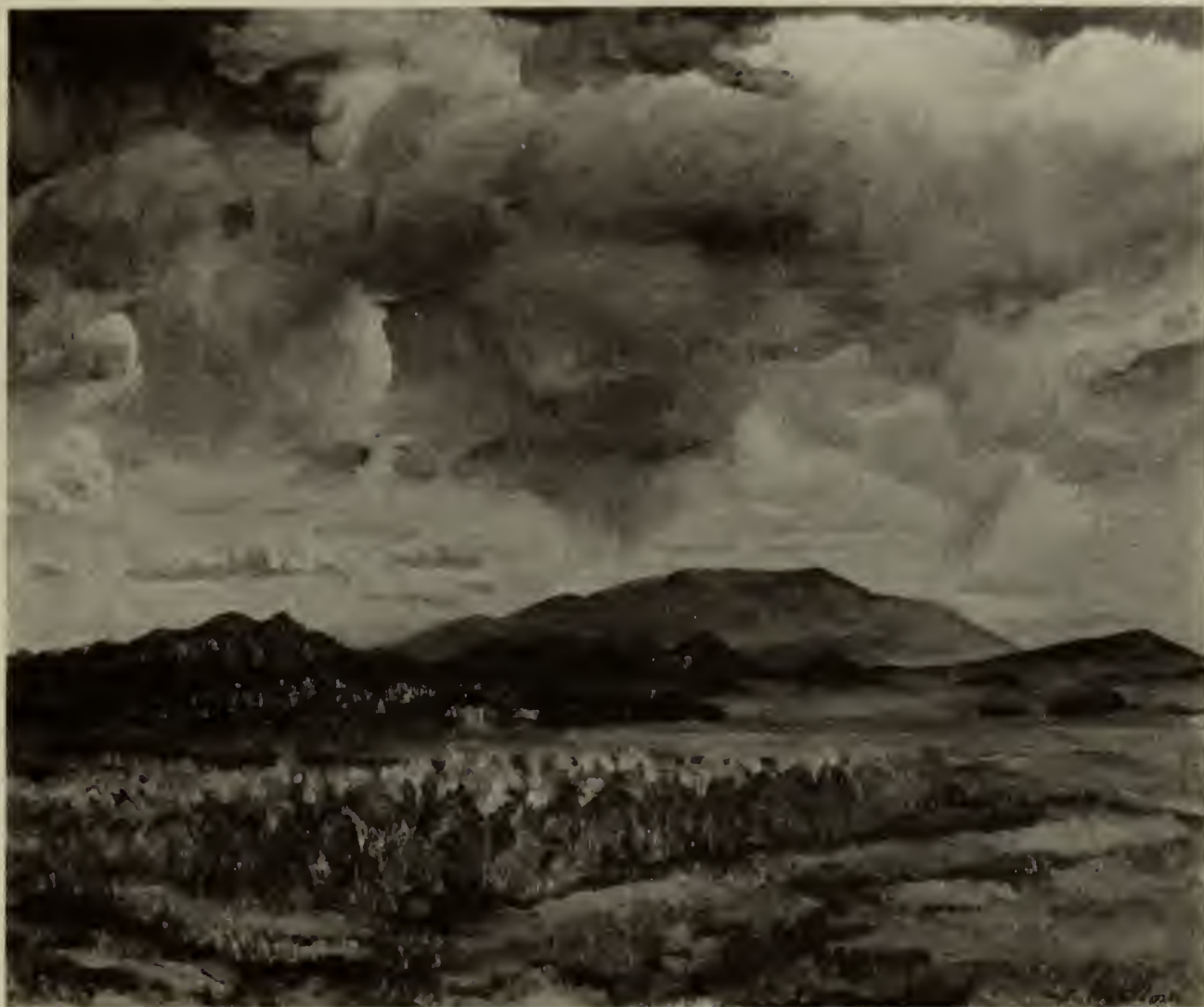
CLOUDS OVER GREAT SOUTH MOUNTAIN (Santa Fe). 1920. 20 x 24. Hamlin Collection, Bowdoin College.