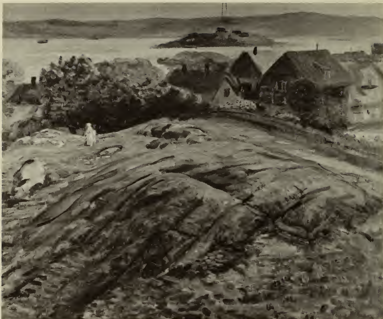
NEAR SUNSET, GLOUCESTER. 1914. 20 x 24. Hamlin Collection, Bowdoin College.