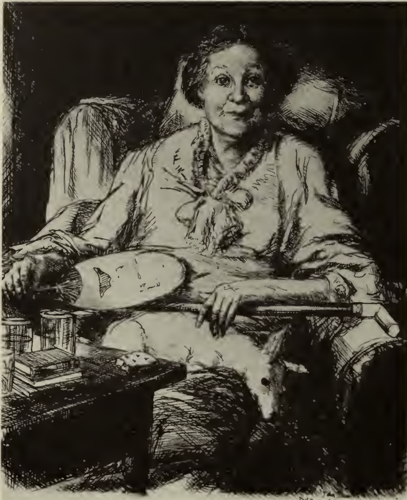
MOTHER. 1906. Etching, 8\frac{5}{8} \times 7\frac{1}{8} . Hamlin Collection, Bowdoin College.