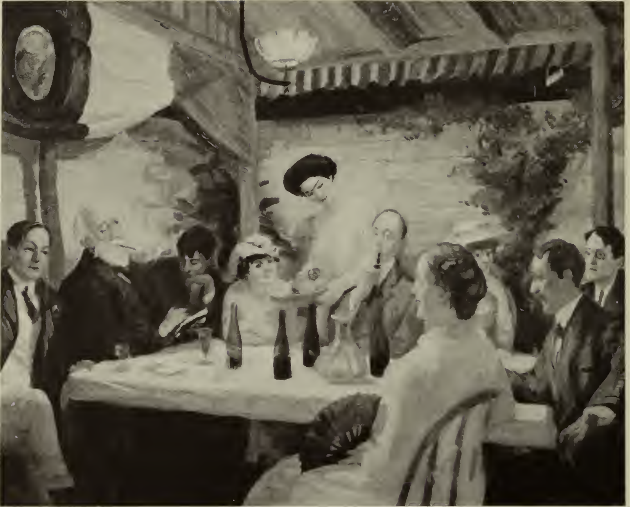
YEATS AT PETITPAS. 1910. 26\frac{3}{8} x 32\frac{1}{4} . Corcoran Gallery of Art.