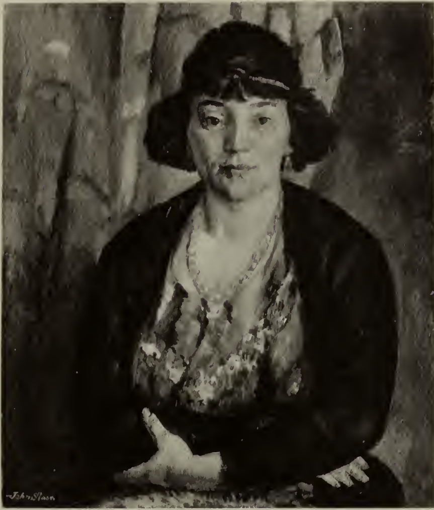
ROMANY MARYE. 1920. 24 x 20. Whitney Museum of American Art.