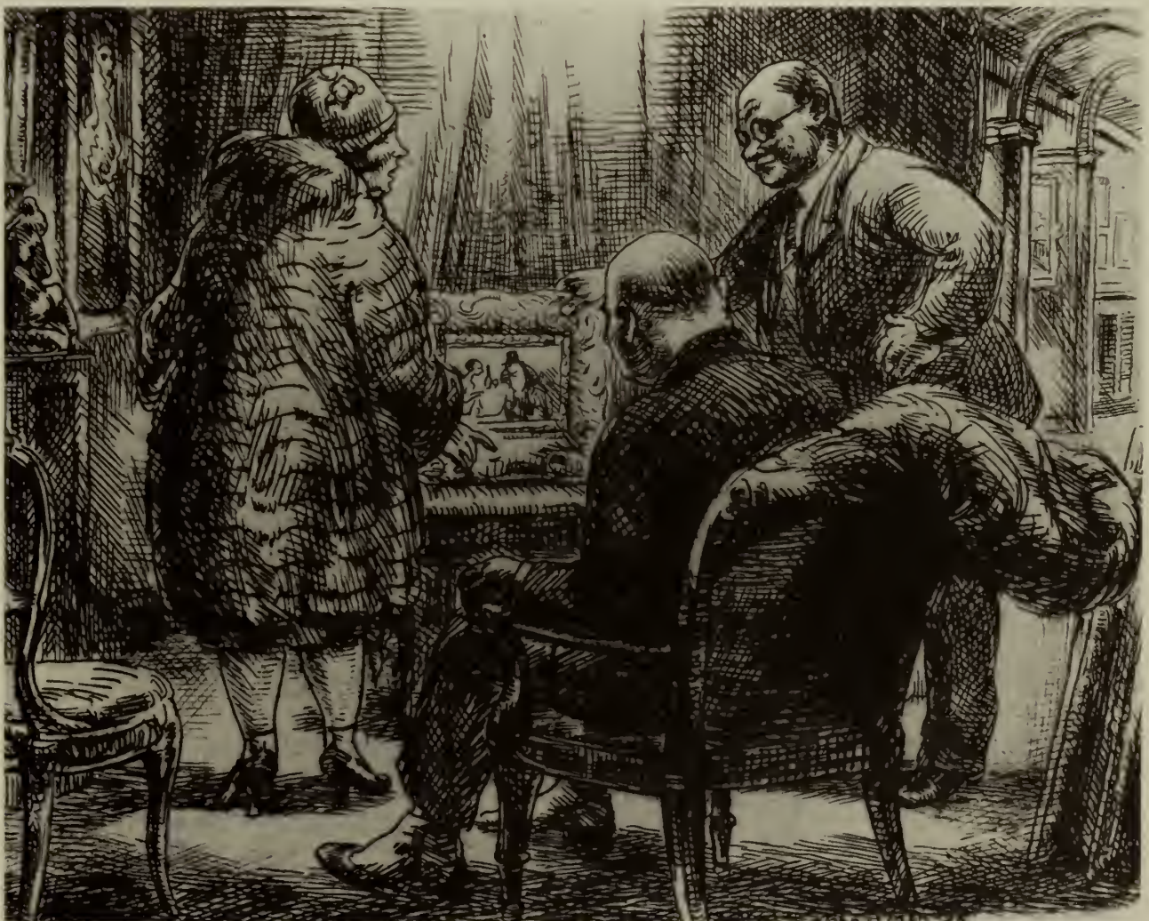
KRAUSHAAR'S. 1926. Etching. 3\frac{7}{8} x 4\frac{7}{8} . Hamlin Collection, Bowdoin College.