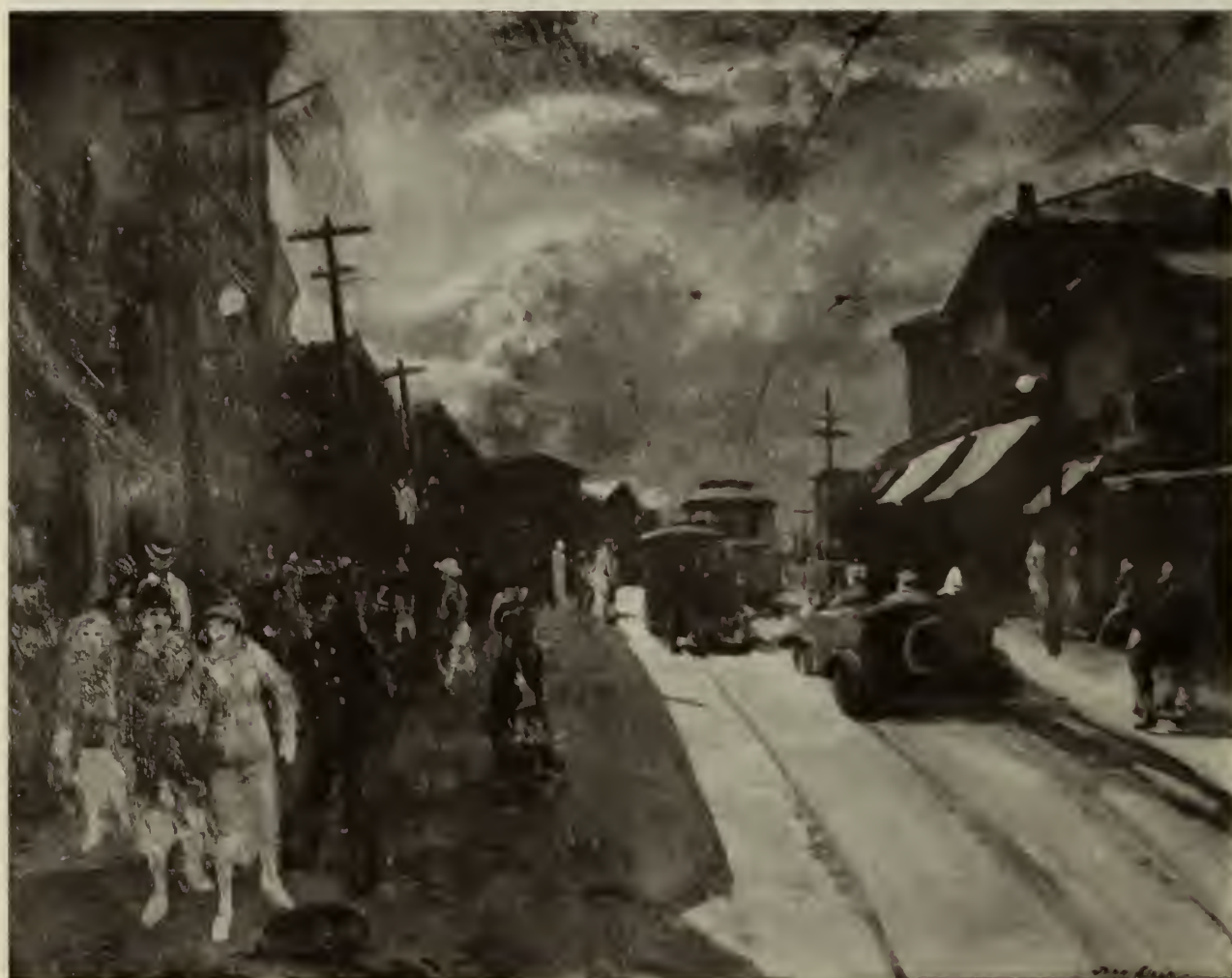
MAIN STREET, GLOUCESTER. 1917. 26 x 32. New Britain Museum of American Art.