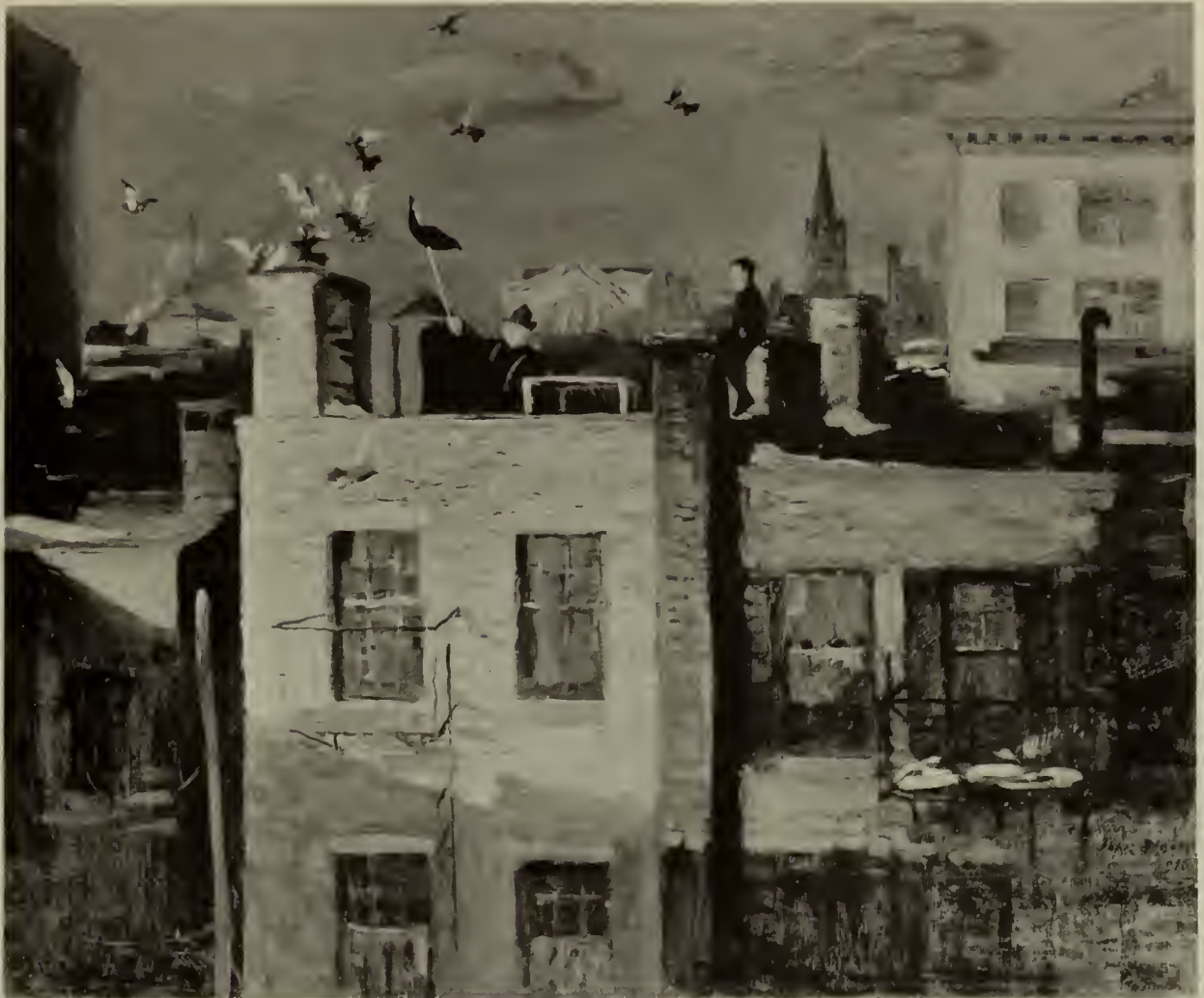
PIGEONS. 1910. 26 x 32. Museum of Fine Arts, Boston.