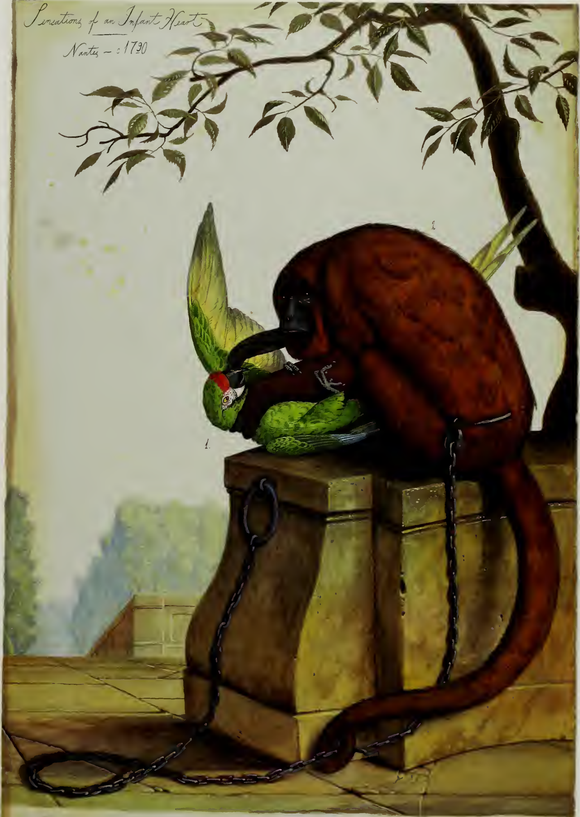
1 Military Macaw - Los Miltars 2 Red Lorikeet - Nantes - Nantes