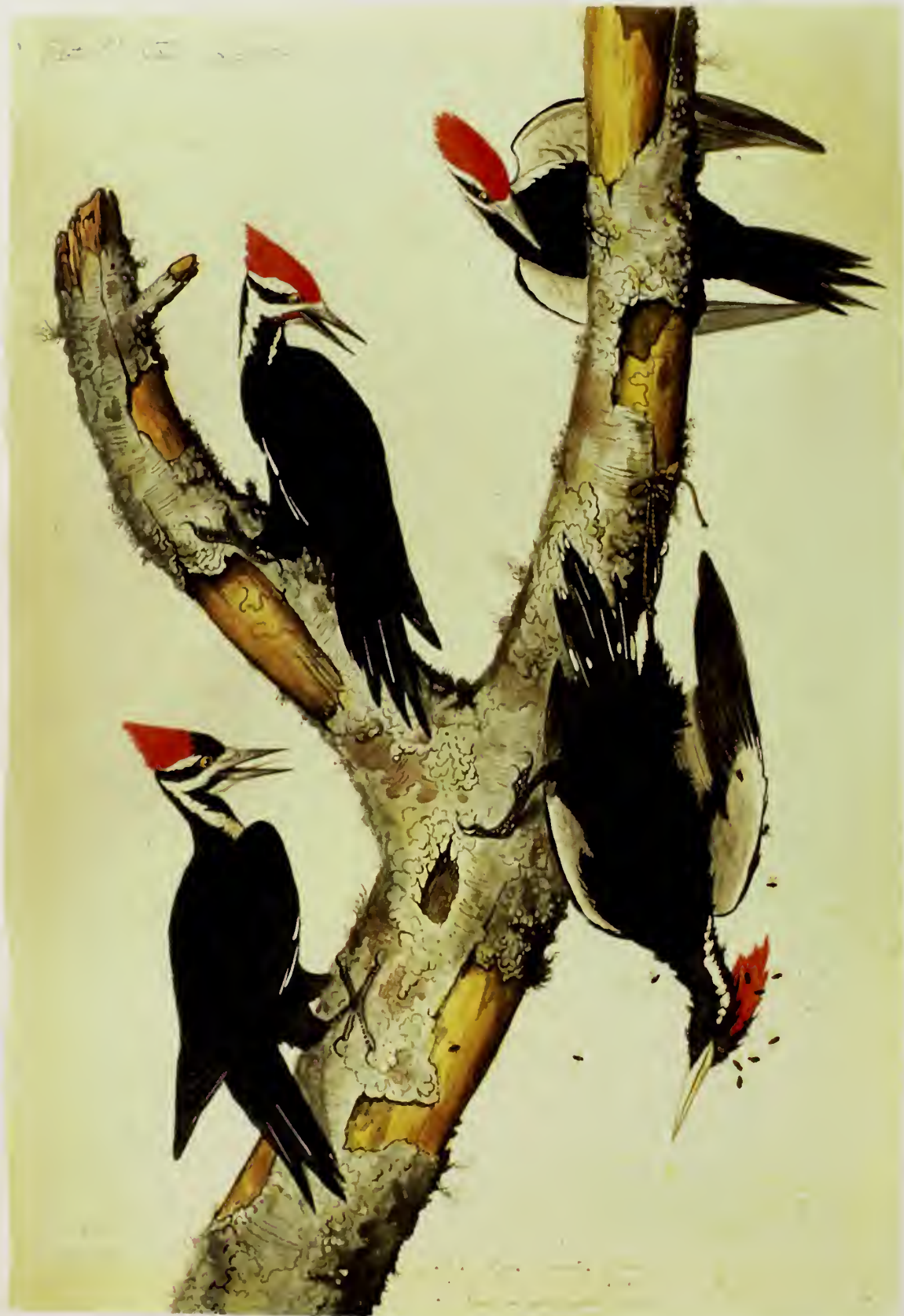
Derisions , 1993 watercolor on paper, 40 × 26 inches