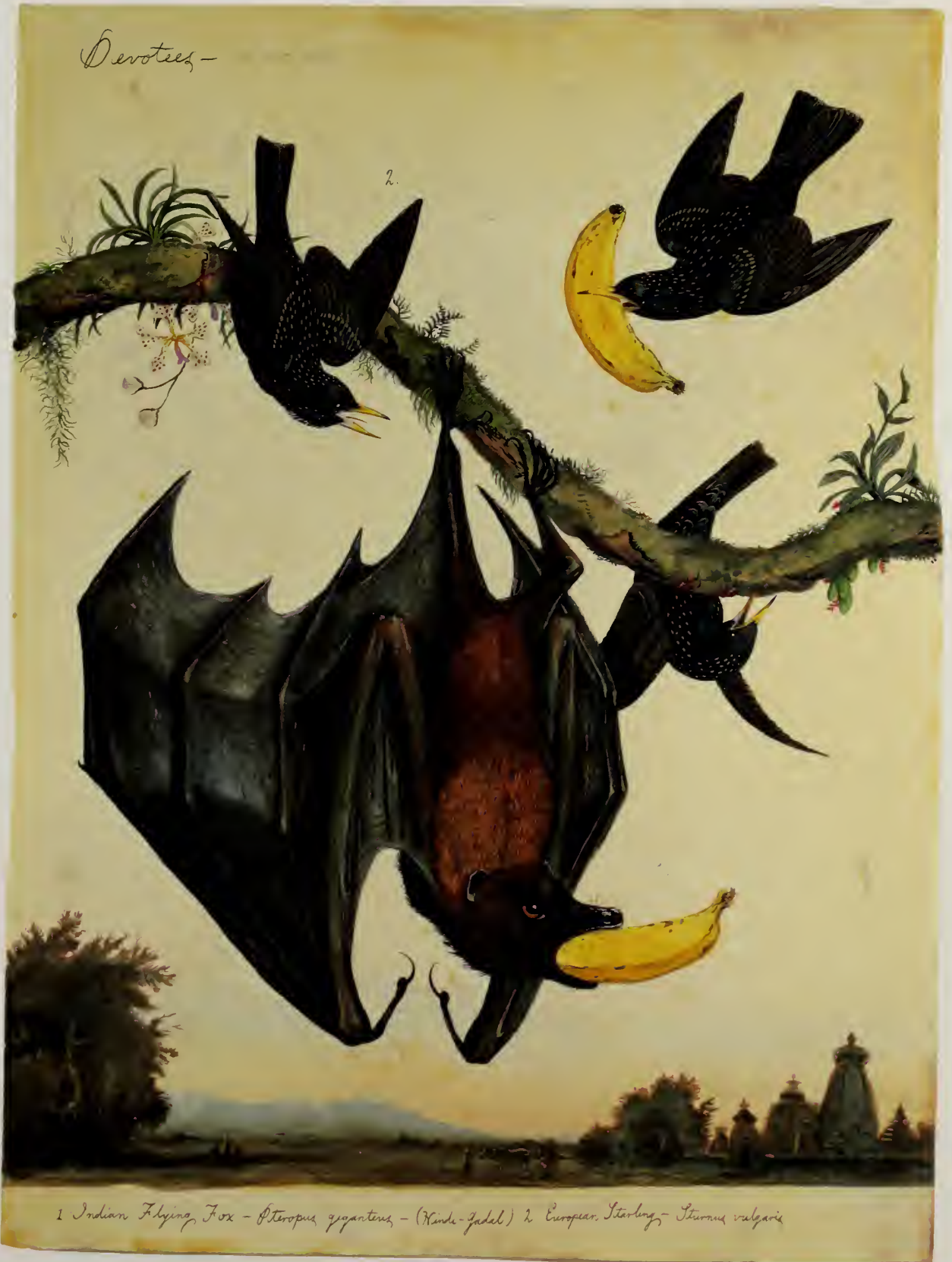
1 Indian Flying Fox - Pteropus giganteus - (Kunde-fadel) 2 European Starling - Sturnus vulgaris