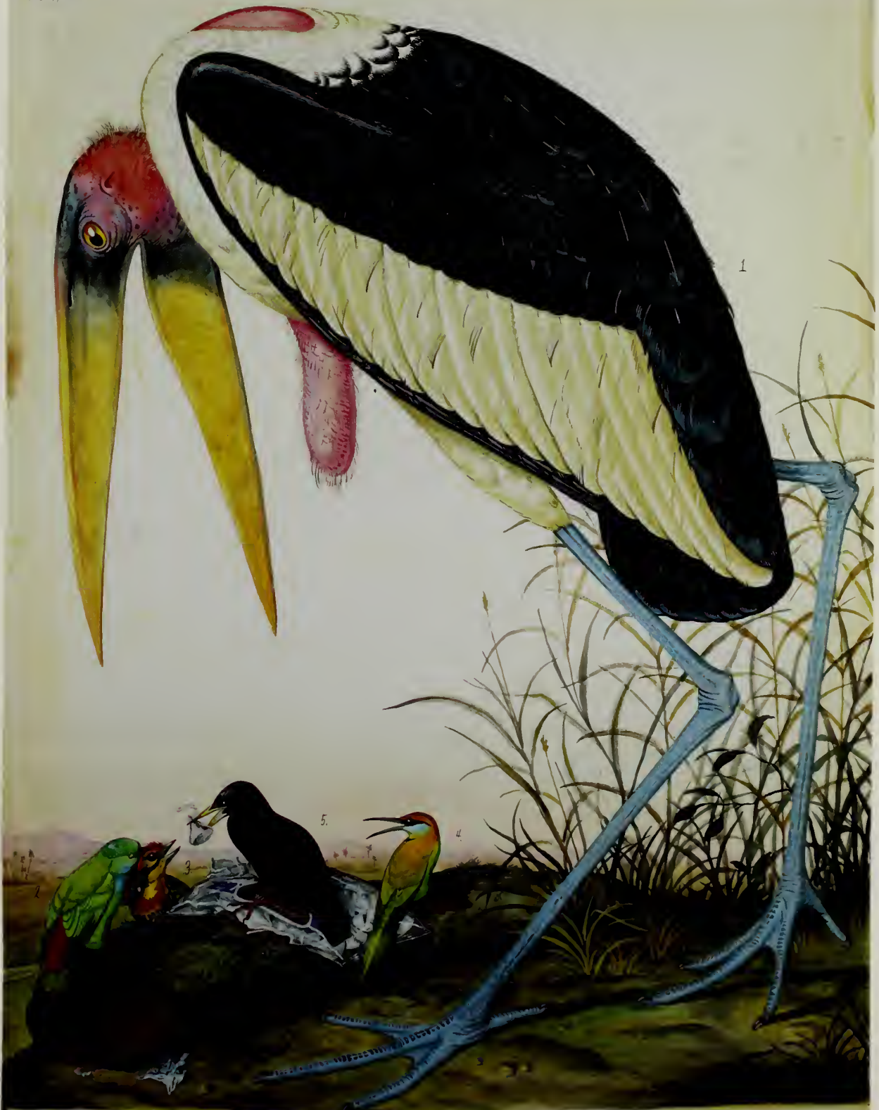
1 Indian Marabou ( Leptoptilos dubius ) 2 Indian Lark ( Larus rostratus ) 3 Indian Lark ( Larus rostratus ) 4 Green Bee Eater ( Micropus orientalis ) 5 European Starling ( Sturnus vulgaris )