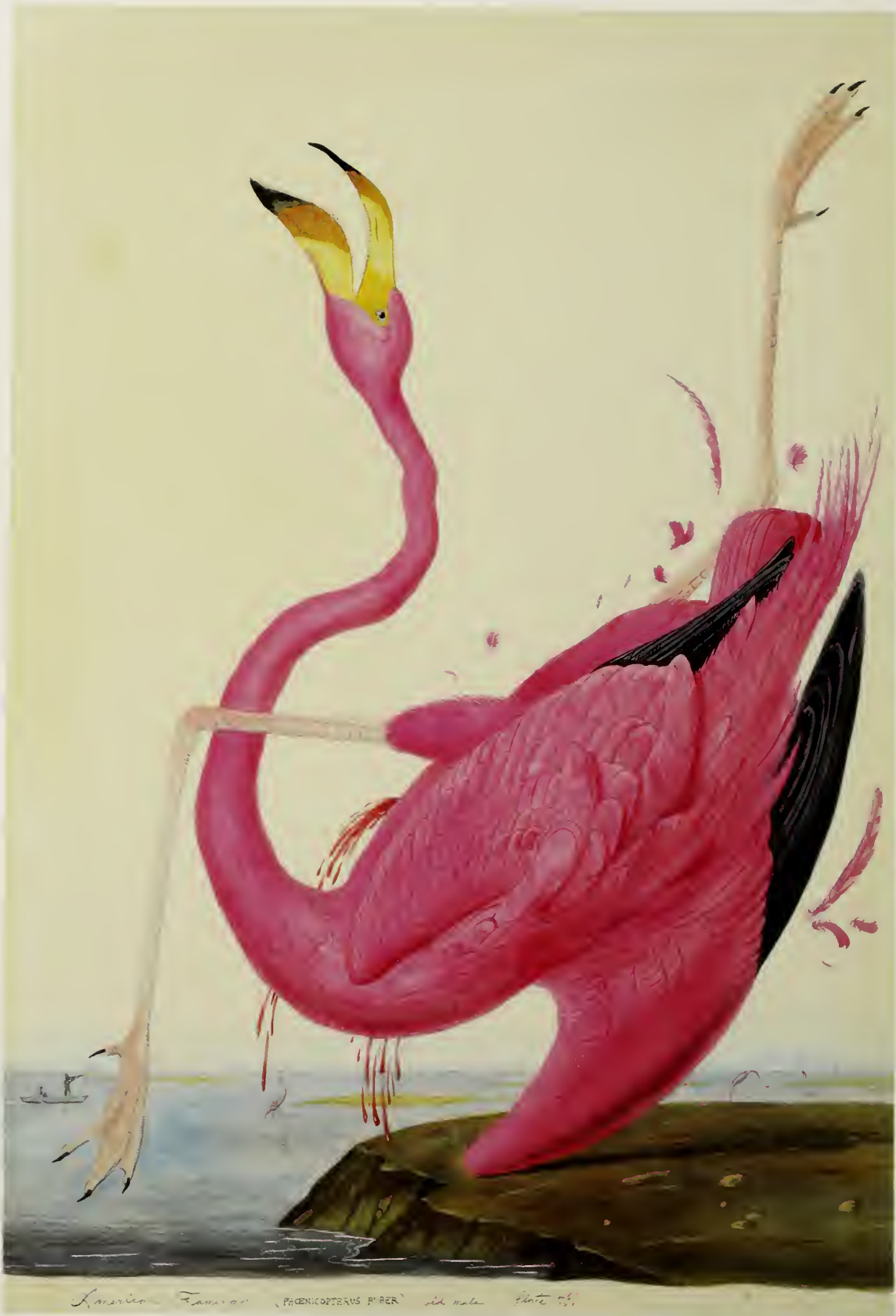
Lamerie - Fameron - PHENICOPTERUS RUBER - old male - plate 15.