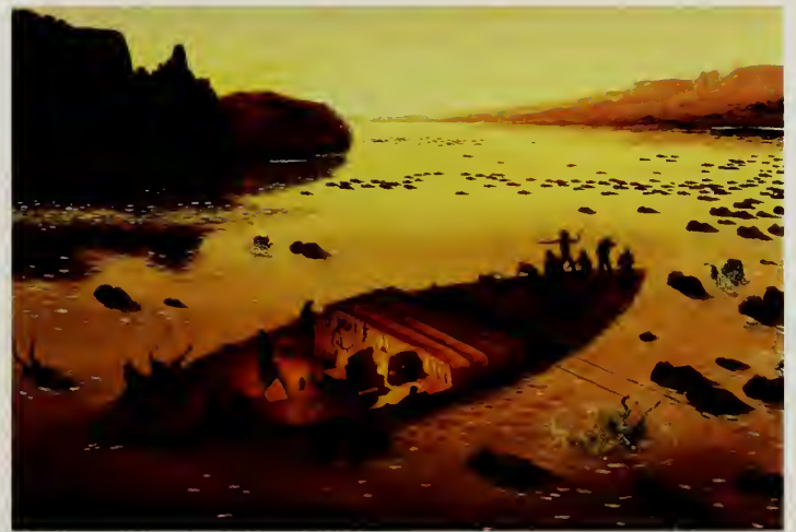
John James Audubon: The Head Full of Symmetry and Beauty, 1991 oil on linen 64 3/4 × 93 3/4