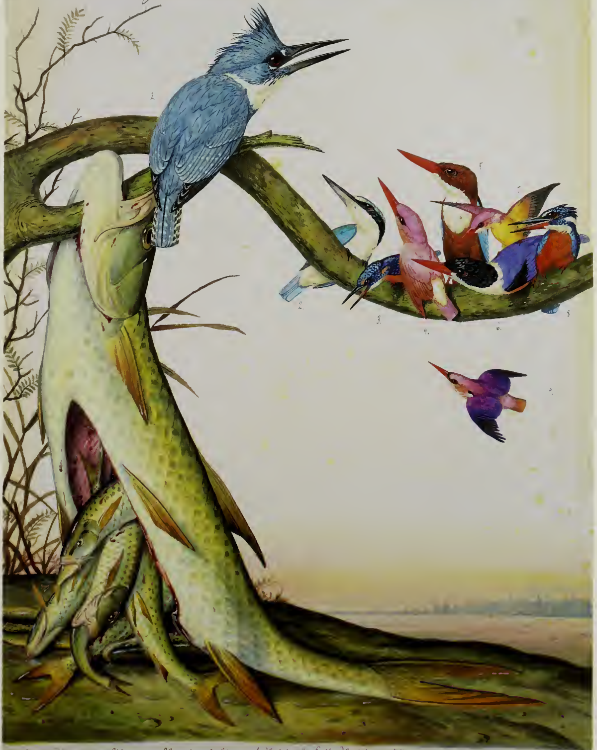
1 Belled Kingfisher 2 Whitebreasted Kingfisher 3 Blue eared Kingfisher 4 Ruddy Kingfisher 5 Whitebreasted Kingfisher 6 Blackcapped Kingfisher 7 Rufous-backed Kingfisher 8 Blyth's Kingfisher 9 Broadbill Kingfisher