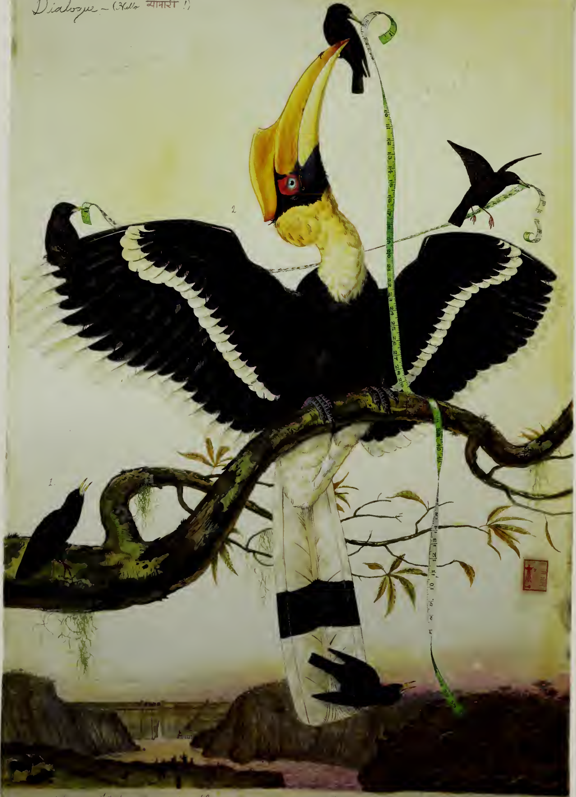
1 European Starling - Sternia vulgaris - (Europe, introduced elsewhere) 2 Great Indian Hornbill - Buccones hornorum (India, and parts of Malaya)