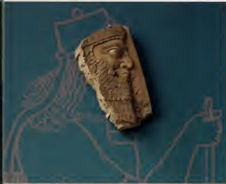
The Assyrian Gallery. Note the installation of a sculpture fragment of the head of King Ashurnasirpal II on the left side of the back wall (detail above).