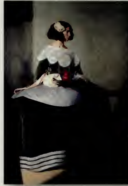
Detail from 89 Seconds at Alcázar , by Eve Sussman and the Rufus Corporation, the first video to be featured in the new Media Gallery.

In its unique envisioning of the past through the distinctly modern medium of high-definition video, 89 Seconds at Alcázar complements the Museum's reopening programming by enlivening the dialogue between past and present. In the first video to be featured in the new Media Gallery, contemporary artist Eve Sussman and the Rufus Corporation imaginatively "capture" the moments leading up to and immediately following the dynamic moment of artistic conception in Diego Velázquez's dazzling and iconic painting Las Meninas .