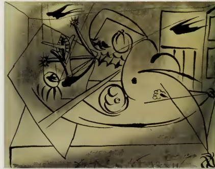
Selected works from the exhibition, left to right: