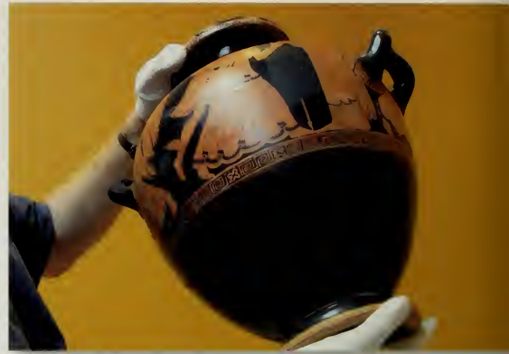
left to right: “Niobid Painter” Red Figure Hydria Greek, ca. 460-450 B.C.E. 1908.3