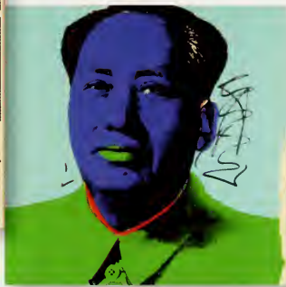
Selected works from the exhibition, left to right beginning on facing page: